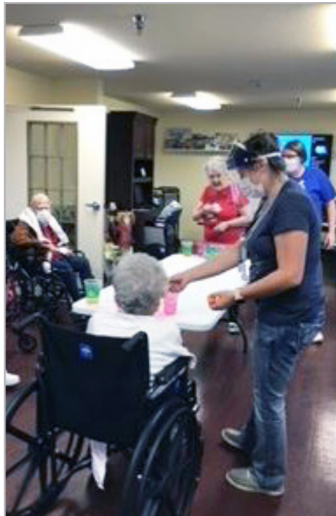
Residents and staff both having a blast at our campus retreat!