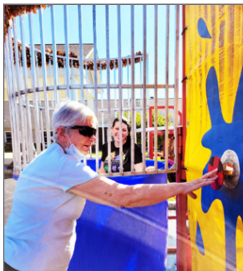
Our residents enjoyed dunking our Life Enrichment Director during our Fall Retreat!