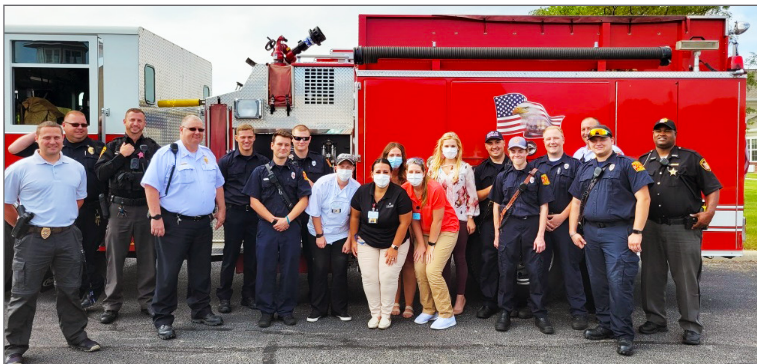
LOM loves our Hometown Heroes