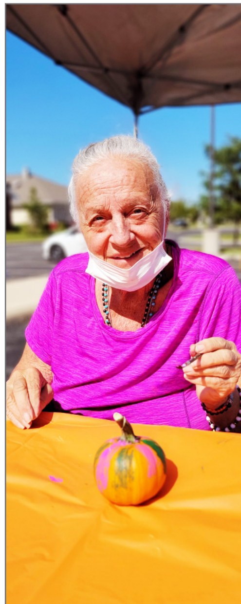
All smiles while painting mini pumpkins!