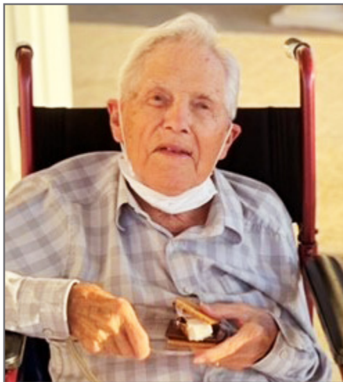
The way to our residents hearts...S'mores!