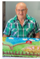
Art is 80!