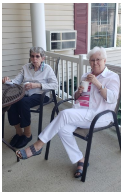
An Afternoon out on the patio with floats and fellowship