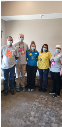
Care Bear Day