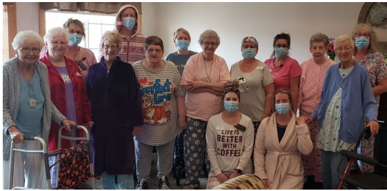
It's Pajama day