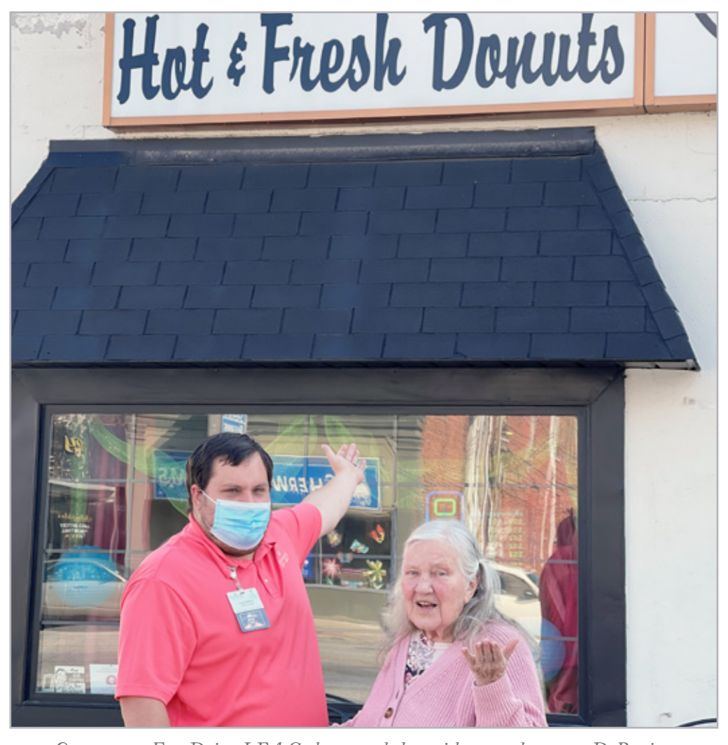
On a recent Fun Drive LEA Cody treated the residents to donuts at DeRoziers