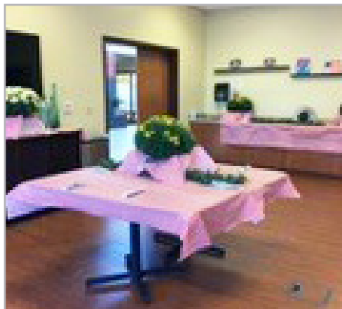
Getting Ready for a Picnic