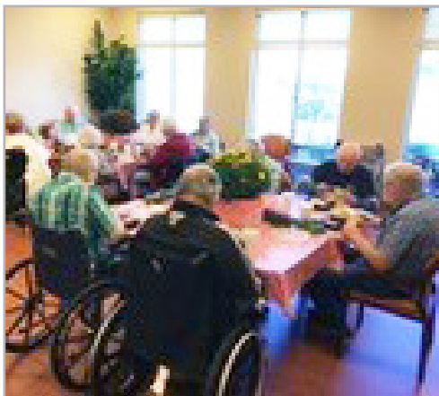
Enjoying our Picnic Together