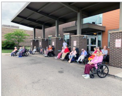
Happy Hour Entertainment