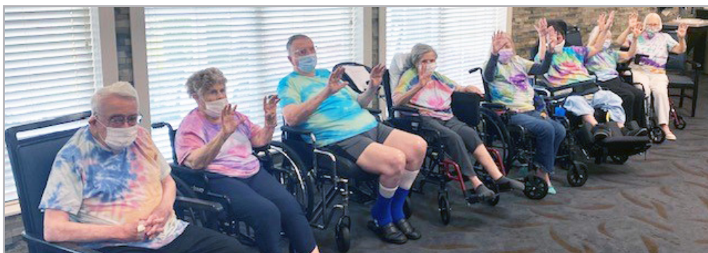
Residents gave us a fashion show during happy hour of the T-shirts they made. This was a 10!