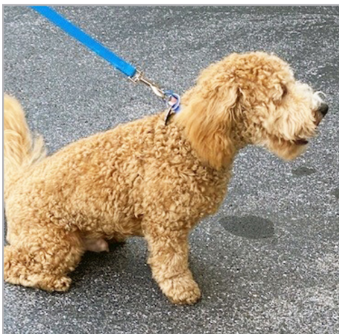
Tubby, the winner of Best in Show