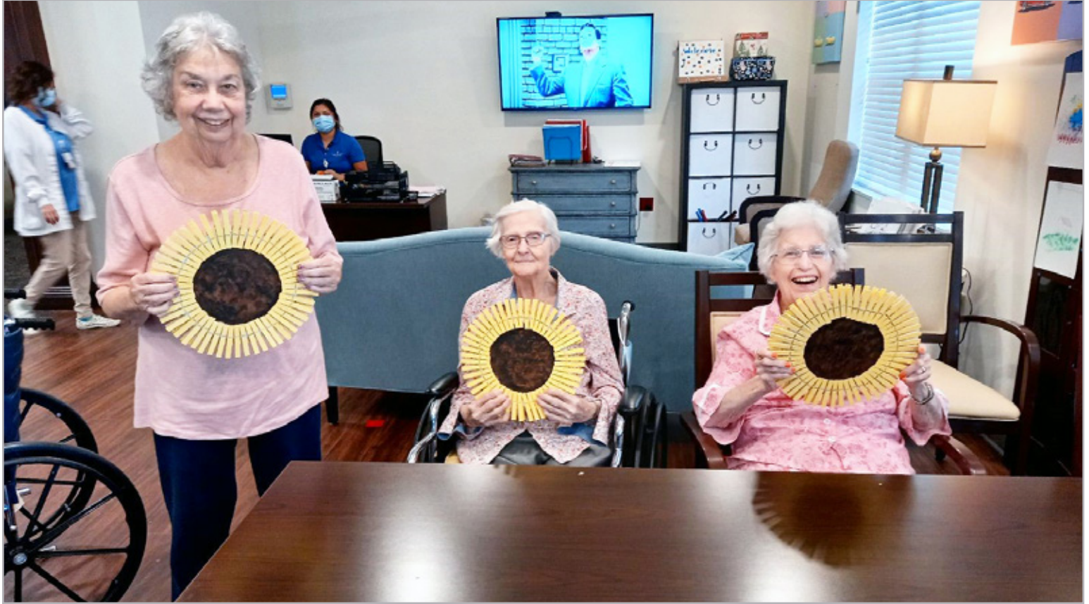
The Artist show their Sunflowers

Our Legacy residents have enjoyed abstract painting. Our residents also painted Roses in the style of stained glass.