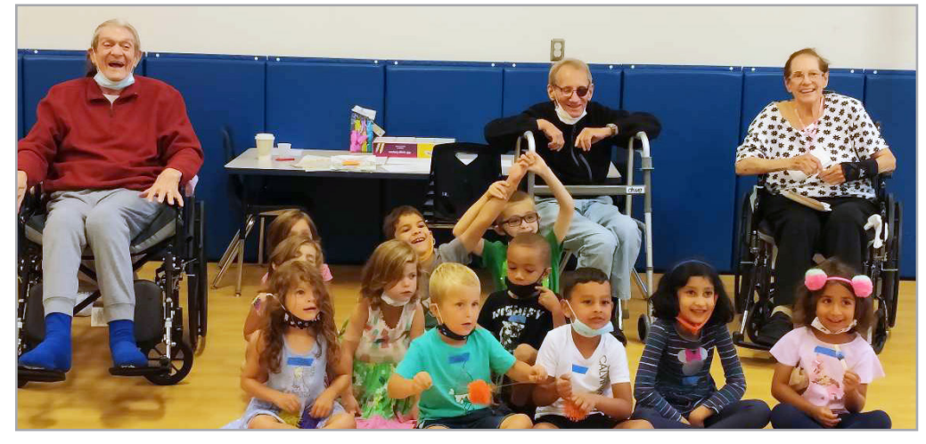
Some of our residents got a chance to meet their pen pals!