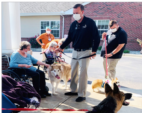
Residents enjoying the dog parade