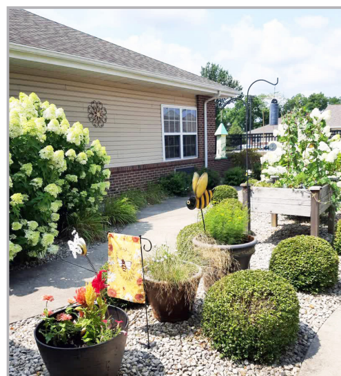
Legacy courtyard, 1st Place divisional Campus in Color winner