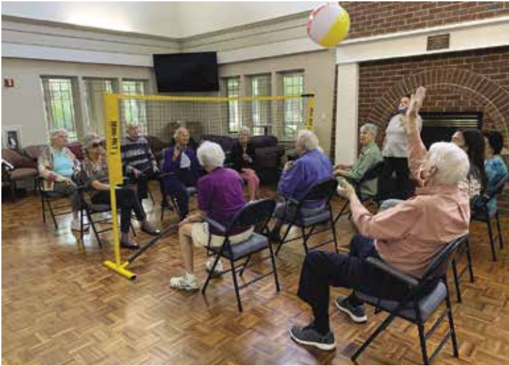
Our residents have become super competitive with our Chair Volleyball.