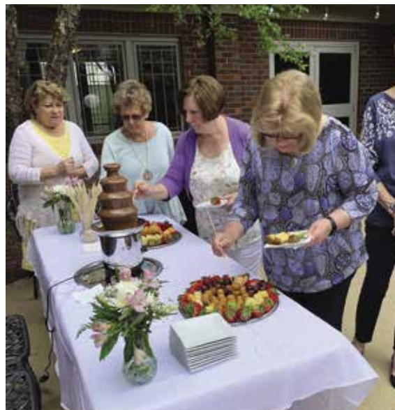
We were excited to host a Volunteer Appreciation Luncheon and welcome our volunteers back to our community after vaccinations. We have a core group of volunteers that are instrumental in supporting our community. We thank them for all they do for our residents!