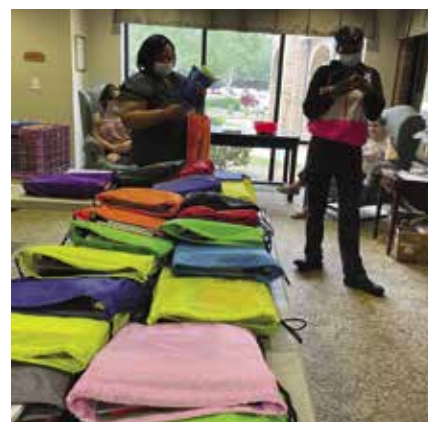
Back-to-school supplies ready to deliver!