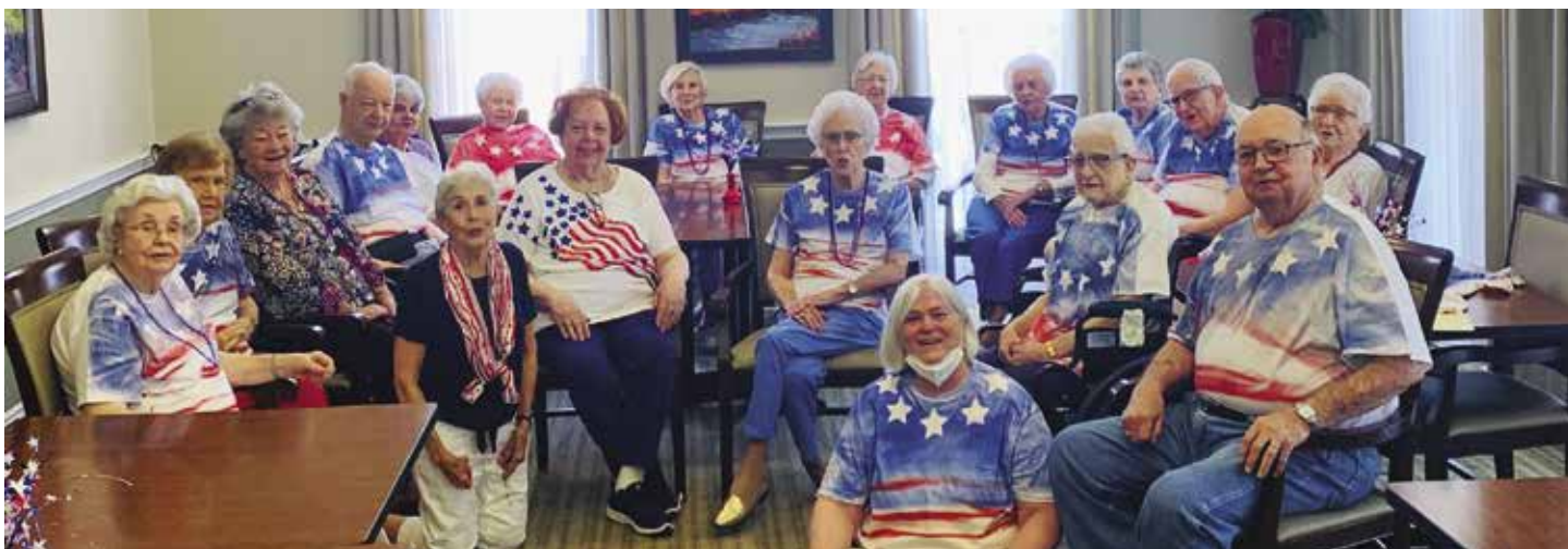
Residents enjoyed taking advantage of a hot July to tie dye their own July 4th shirts!