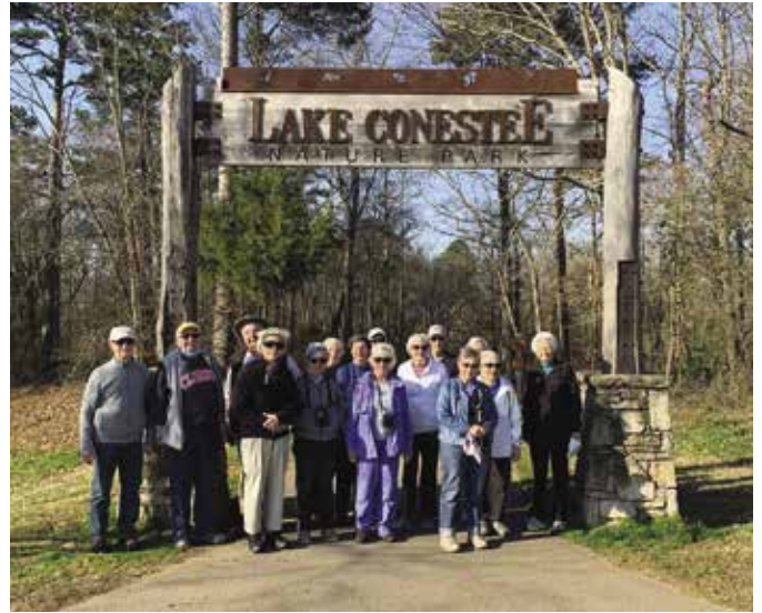
Our first hike of 2021 after we started back with outings was to Lake Conestee in Mauldin, SC. So many beautiful places to explore in our area.