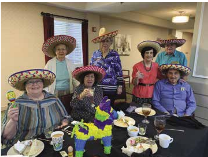
Fiesta and the Siesta! Our residents enjoyed specialty drinks and lunch in honor of Cinco de Mayo.