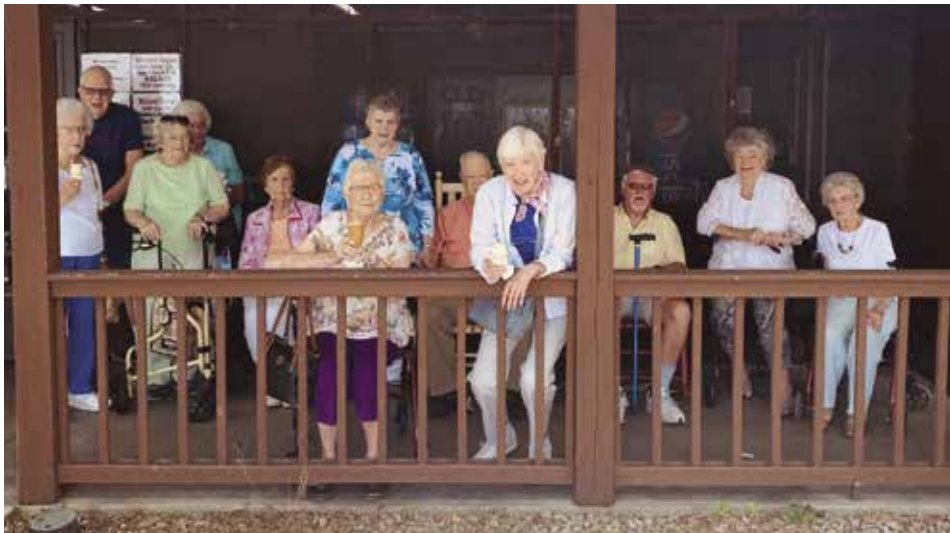
Residents enjoyed visiting McLeod Farms for the day and found their way to lunch!