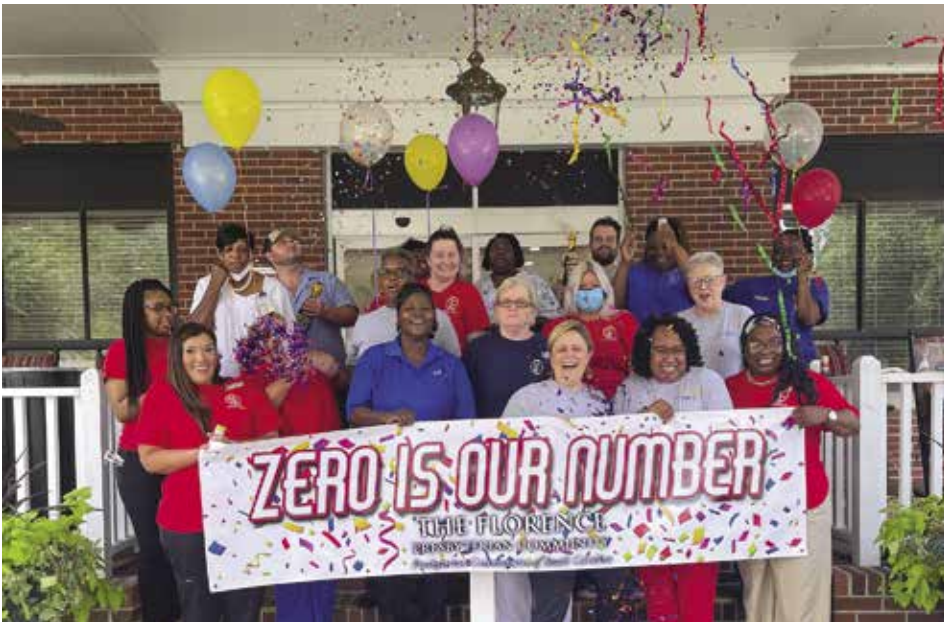
Staff celebrate a deficiency-free skilled nursing federal certification!