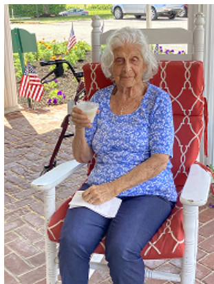
Good friends and lemonade on the porch...doesn't get any better than that.