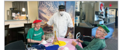
The guys thanking the chef for a great themed meal.