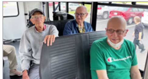
The guys enjoying the bus trip!