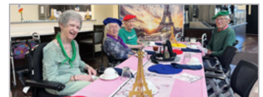
The group enjoying the themed meal by the Eiffel Tower.