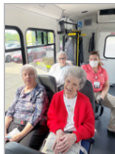
Back to Out and about, O'Charles bound!