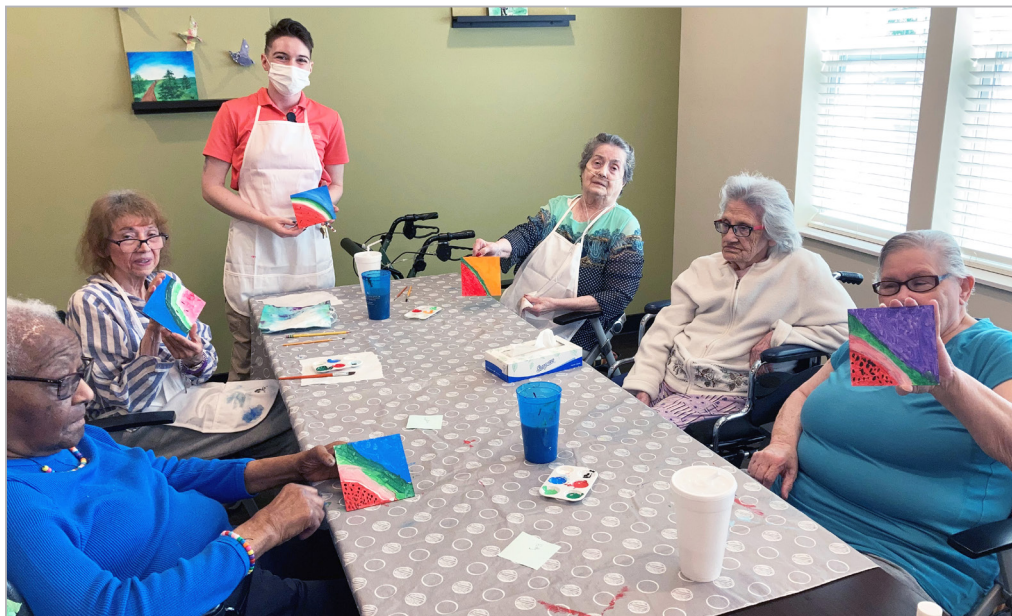
Summertime is Watermelon Time!