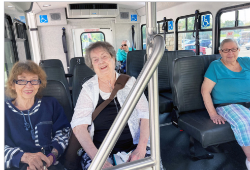
Out and About, Rode Trip to Gahanna Creekside Park