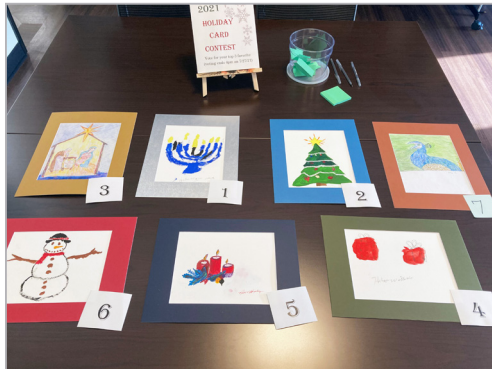
It's Christmas in July!