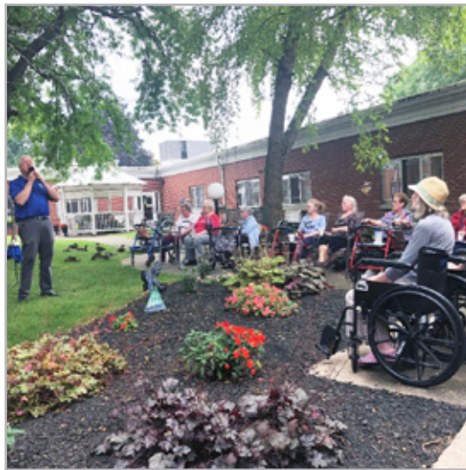
Thank you so much to everyone that came out and enjoyed the music!