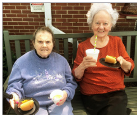
It's all smiles when you have created the perfect hotdog!