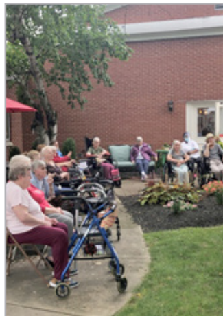
Having fun in the courtyard! It's so nice to be able to listen to live music again.