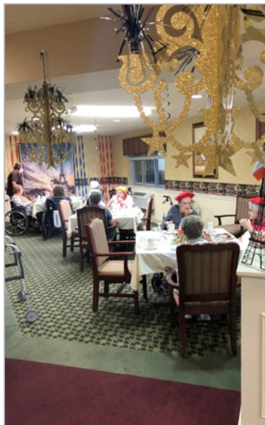
A few of our residents enjoying the French café setting with a view of the Eiffel Tower!