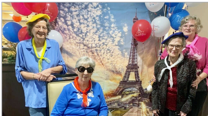
These wonderful ladies enjoyed laughter and conversation all evening as they traveled through France together. Of course, they had to stop by for a picture at the Eiffel tower.