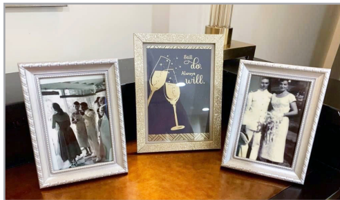
Beautiful pictures of the day they said "I do."