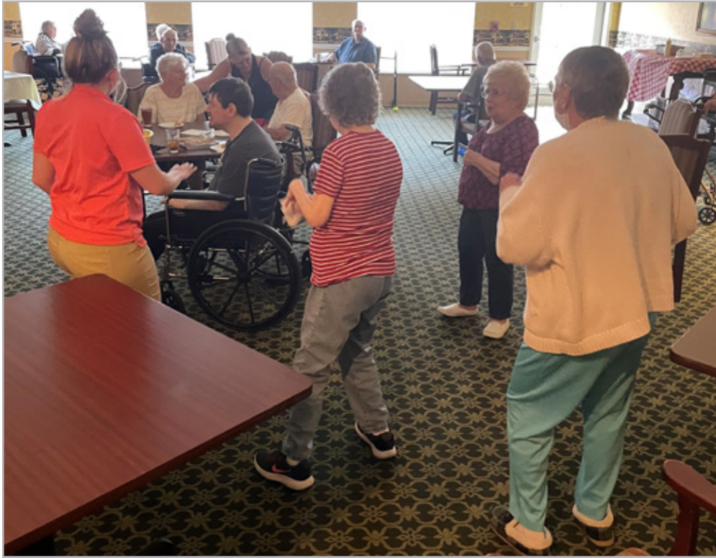
Dance parties are always a hit at Happy Hour!