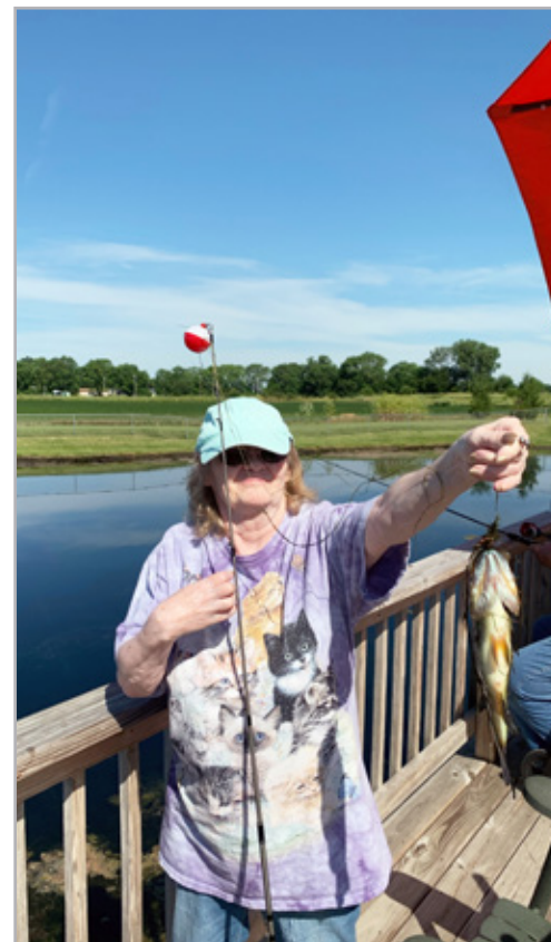
Fishing is one of our favorite outside activities!