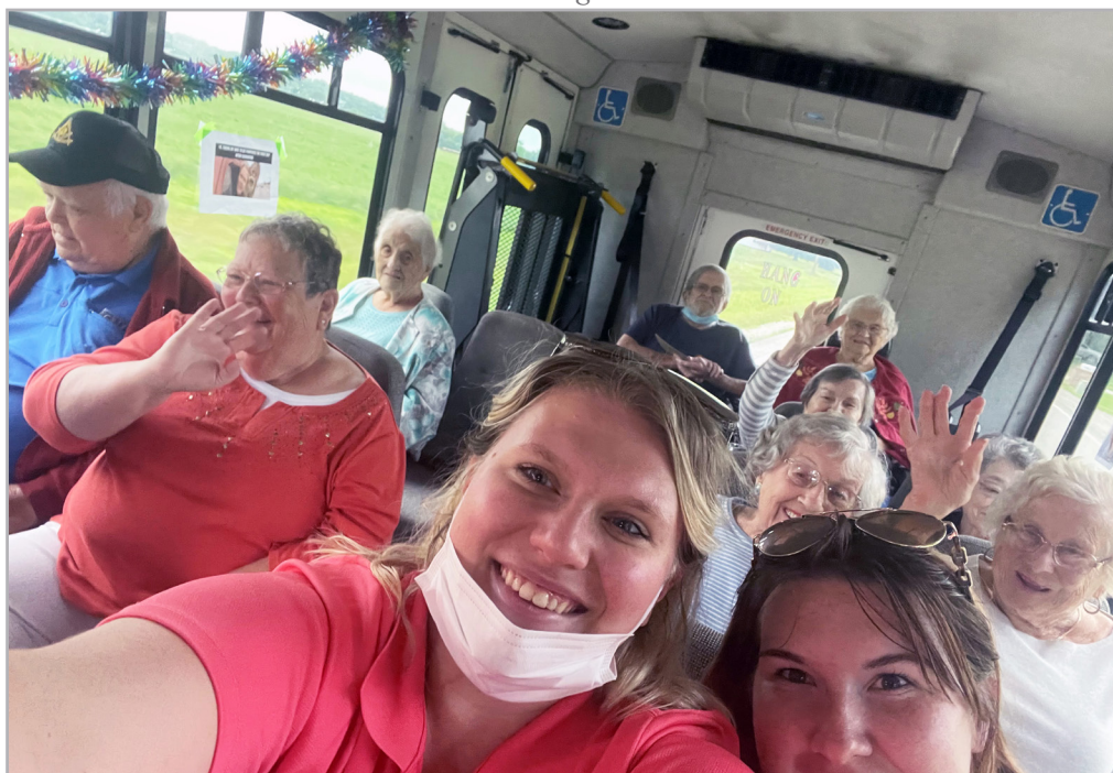
The bus trips are always a hit