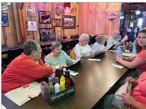
Lunch Bunch at it again at 36 Saloon