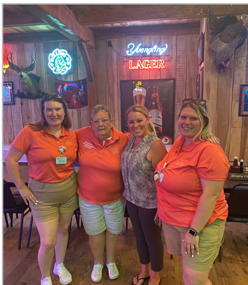
The Life Enrichment Girl on our first outing after the pandemic