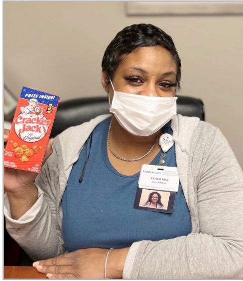
Crystal smiles for the camera on National Crackerjack Day