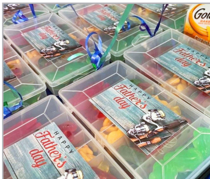
Our Father's Day tackle boxes were a hit!

We "fished" all of our Fathers a "Happy Father's Day" with treat filled tackle boxes, personalized greeting cards, model cars and balloon bouquets – they loved it!