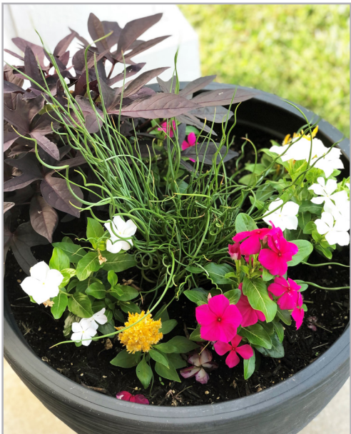
Planted with TLC!