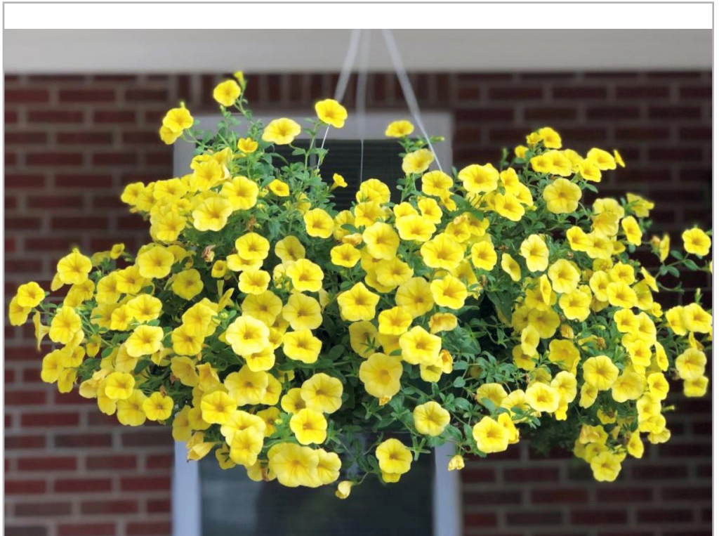
A gorgeous basket of yellow blooms greets all visitors to our campus"

Our Campus in Color program is "blooming" this year as we enjoy the colorful floral combinations that have been planted and tended by our dedicated staff! Flowers and vegetables adorn the courtyards as we look forward to harvest time!