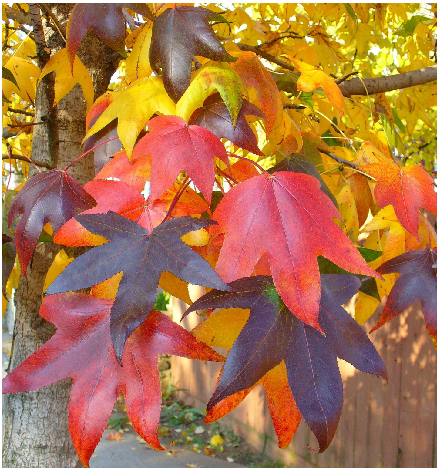
Sweet Gum Tree