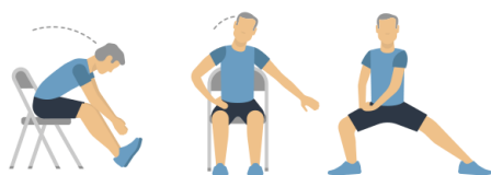
Sit and Reach Stretch