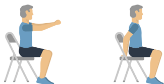
Upper Back Stretch