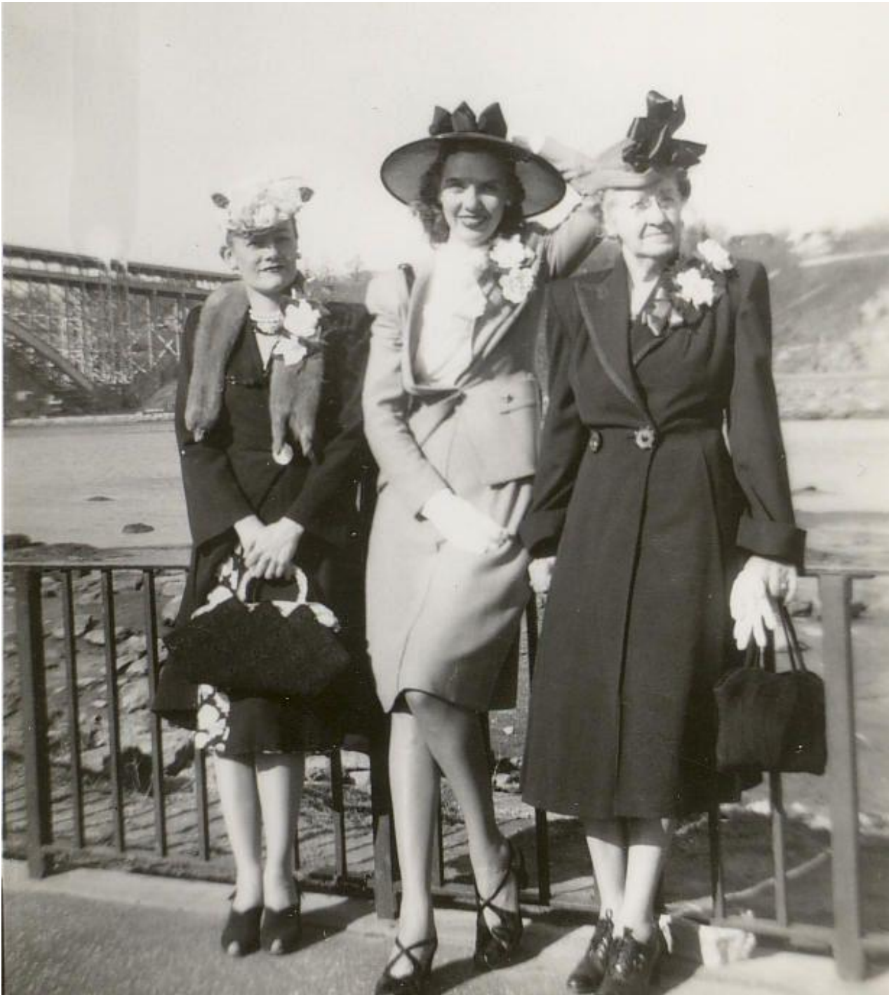
Ladies with Corsages, New Jersey 1947