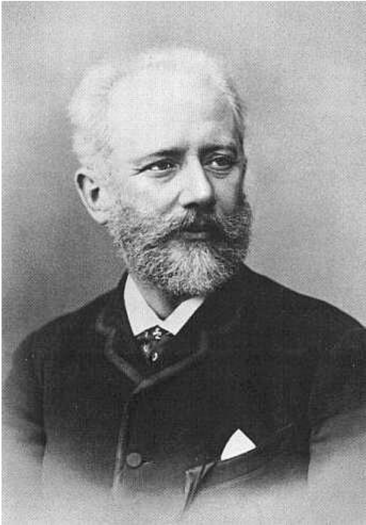
Pytor Ilryich Tchaikovsky

Public Domain, https://en.wikipedia.org/w/index.php?curid=15206534