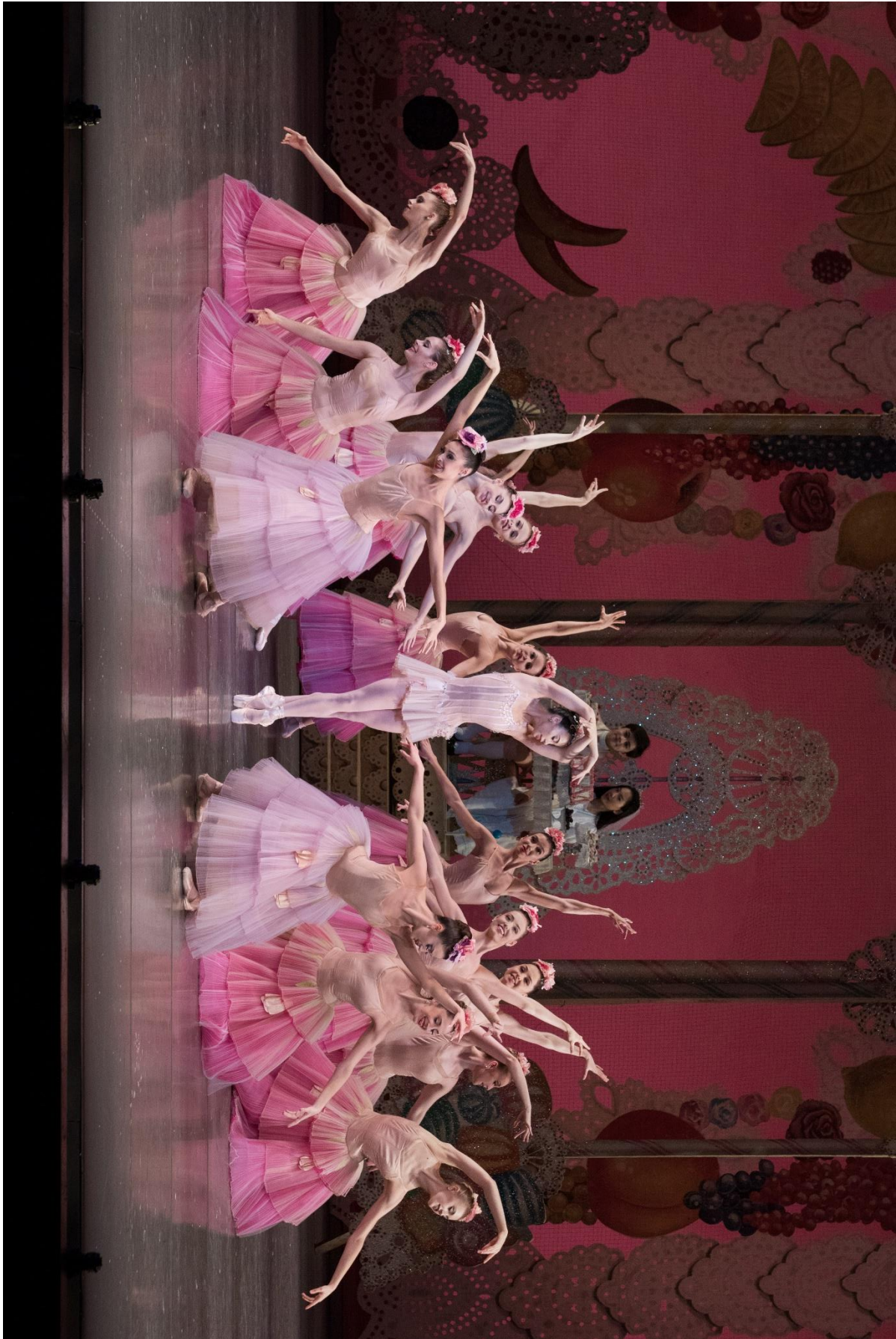
Dew Drop, George Balanchine's The Nutcracker.