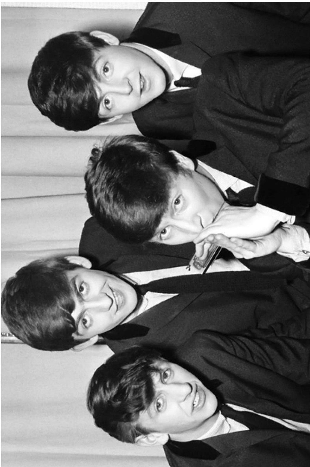
The “Fab Four” in 1962