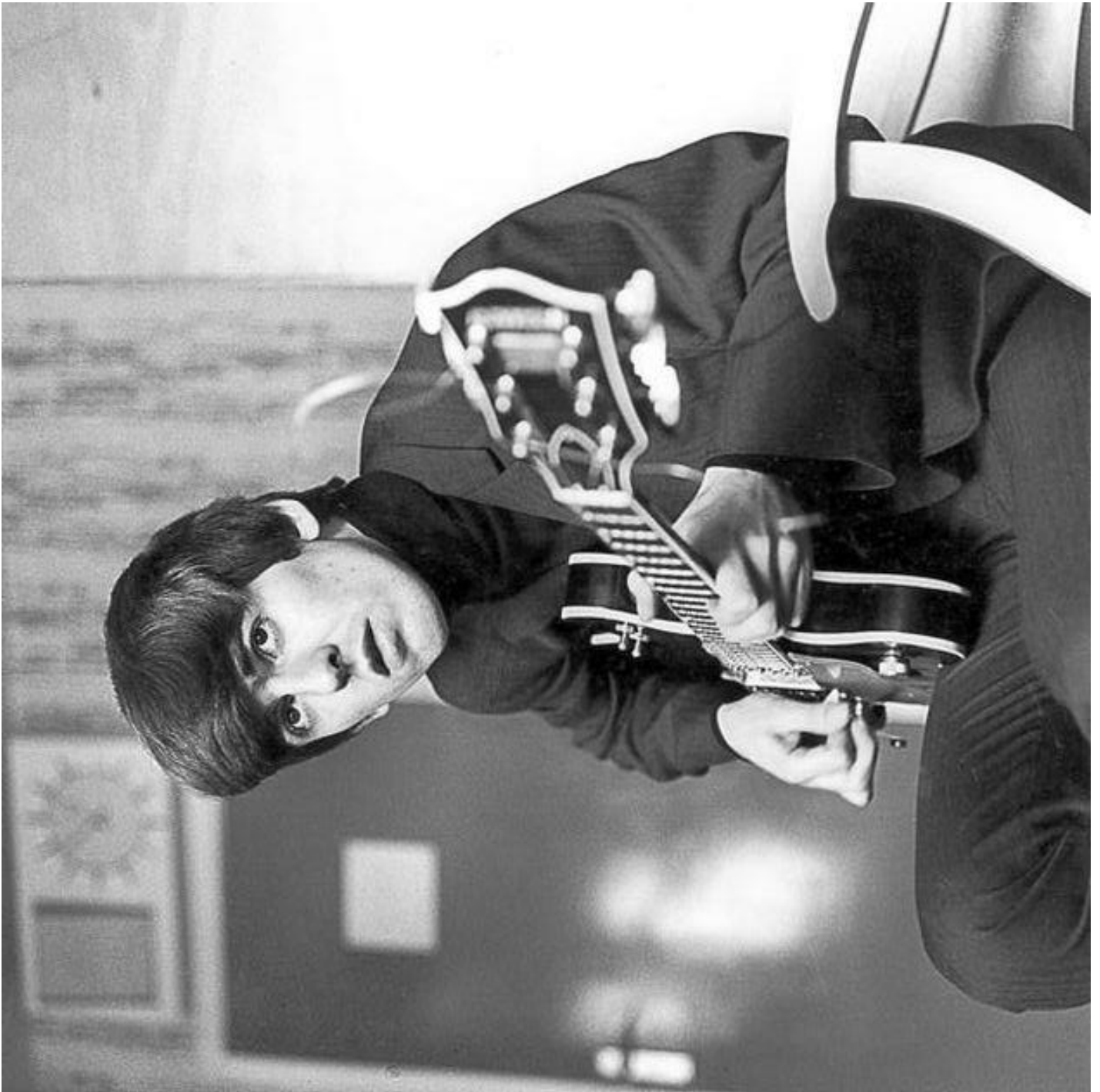
George Harrison