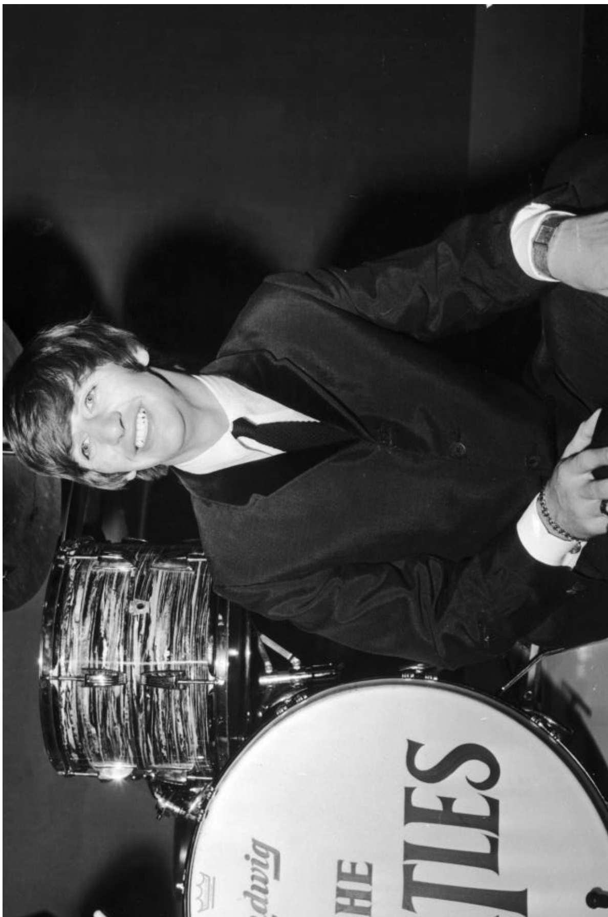
Ringo Starr