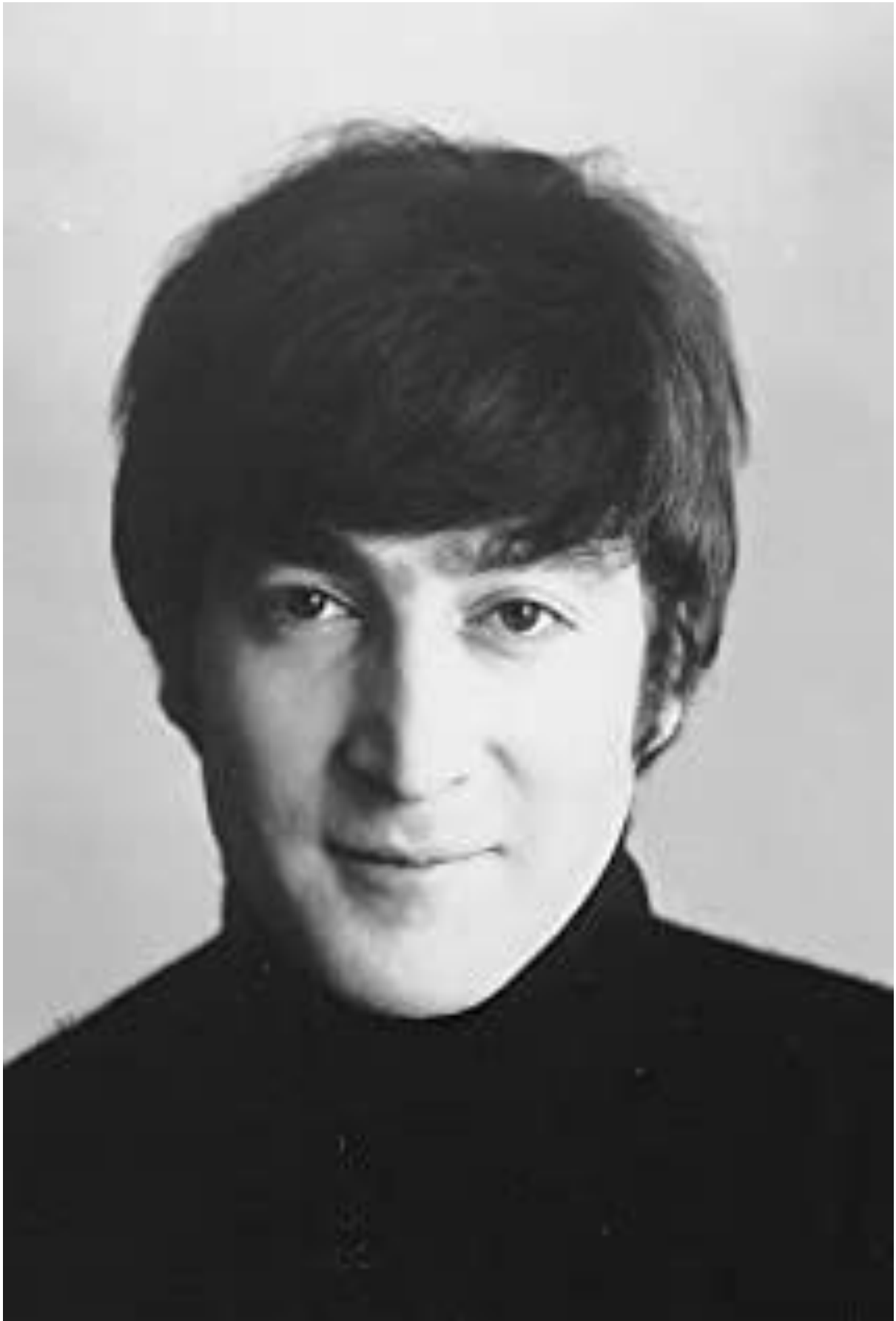
John Lennon