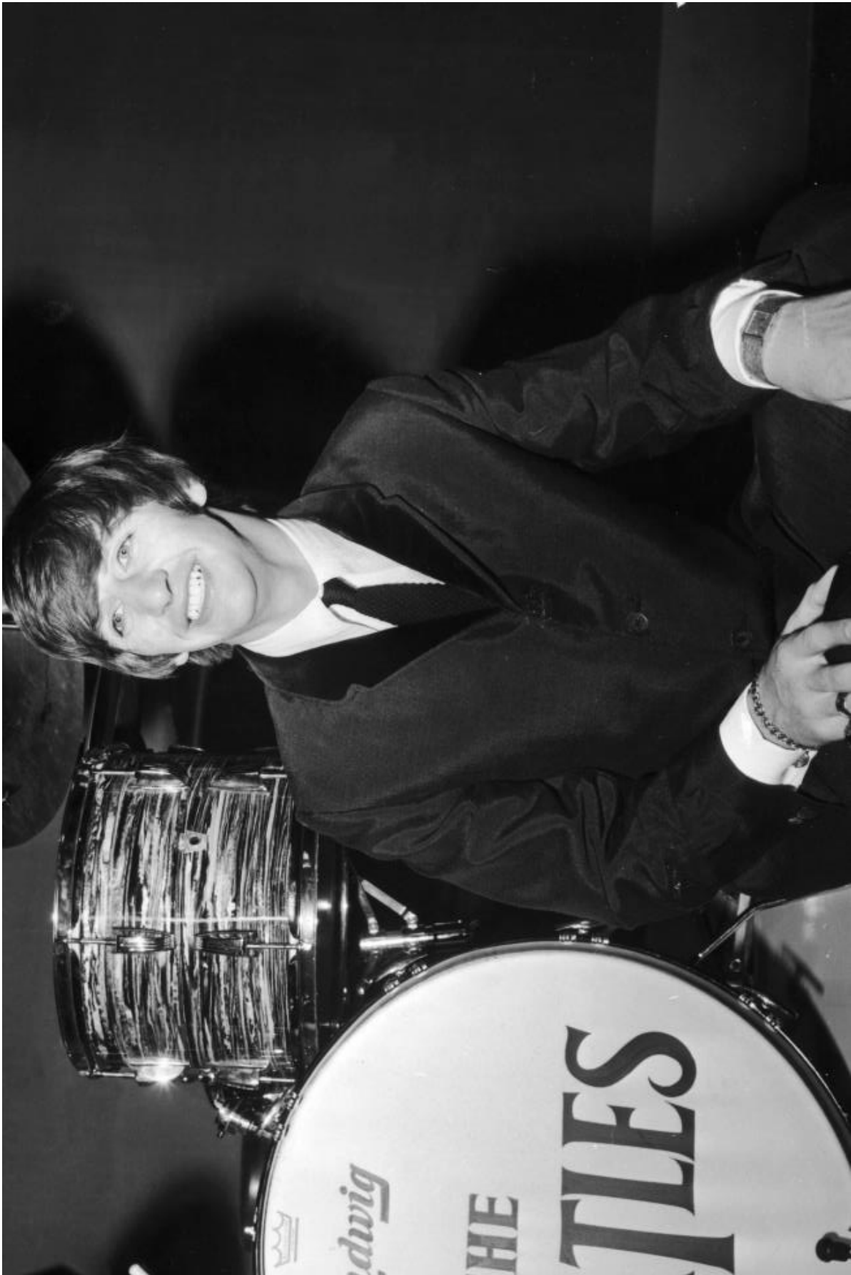
Ringo Starr