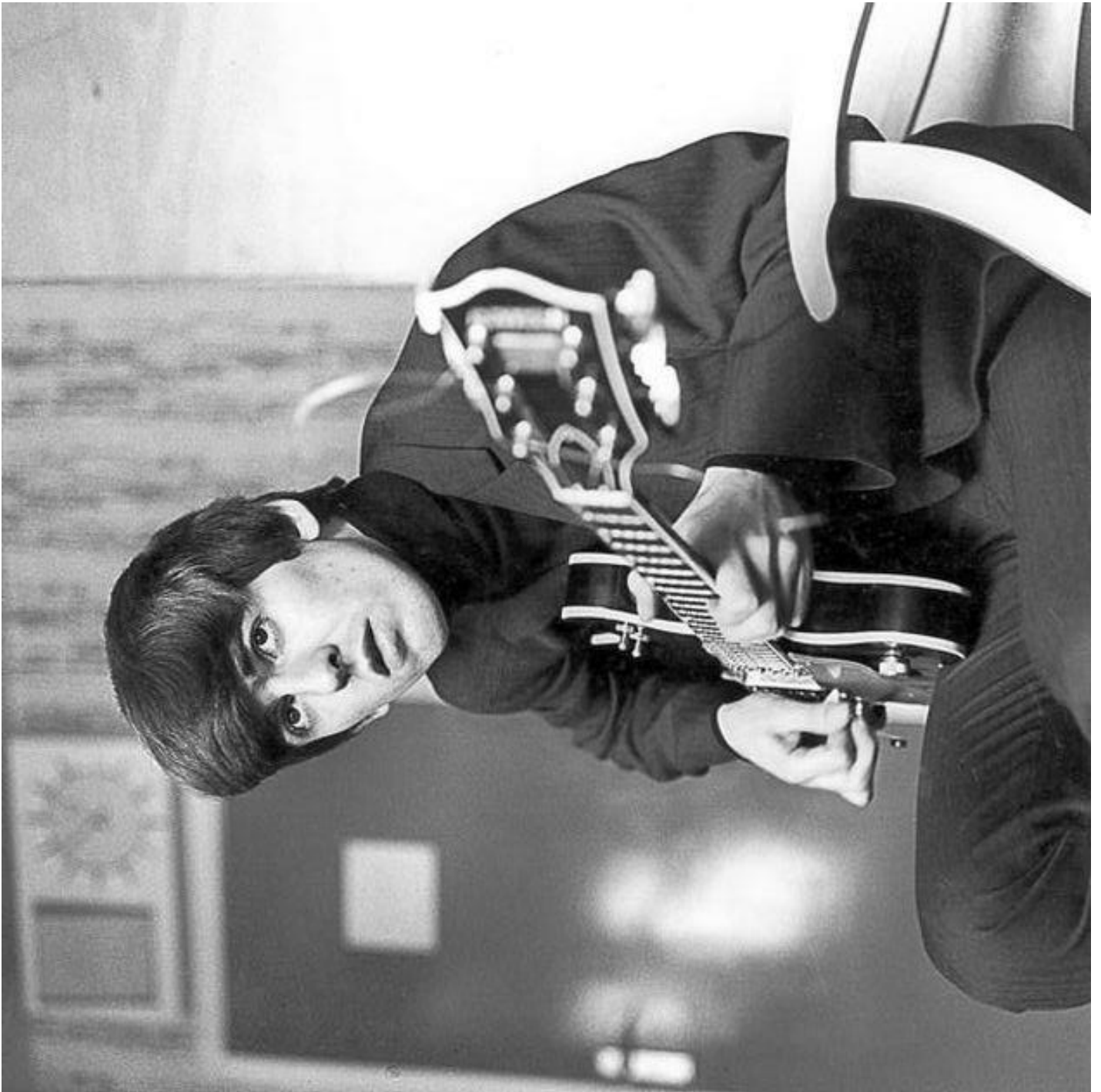
George Harrison