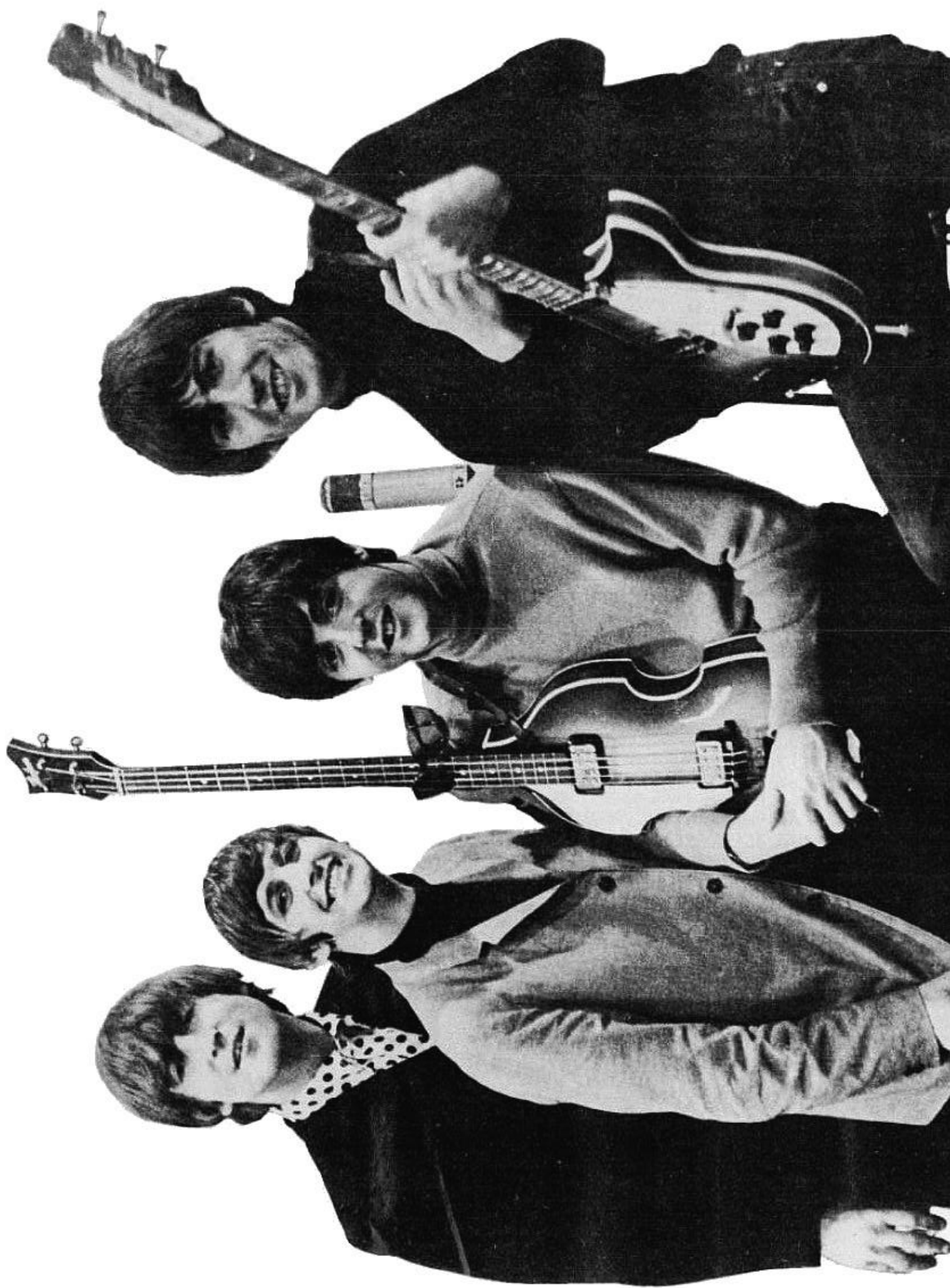
The group in 1965