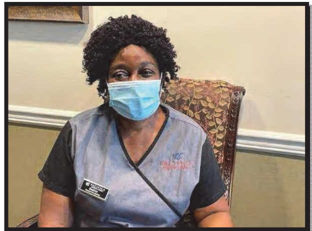
Beatrice Care Staff for 4yr

Thank you for all your hard work in assisting residents and inviting them to activities! Great Team work!