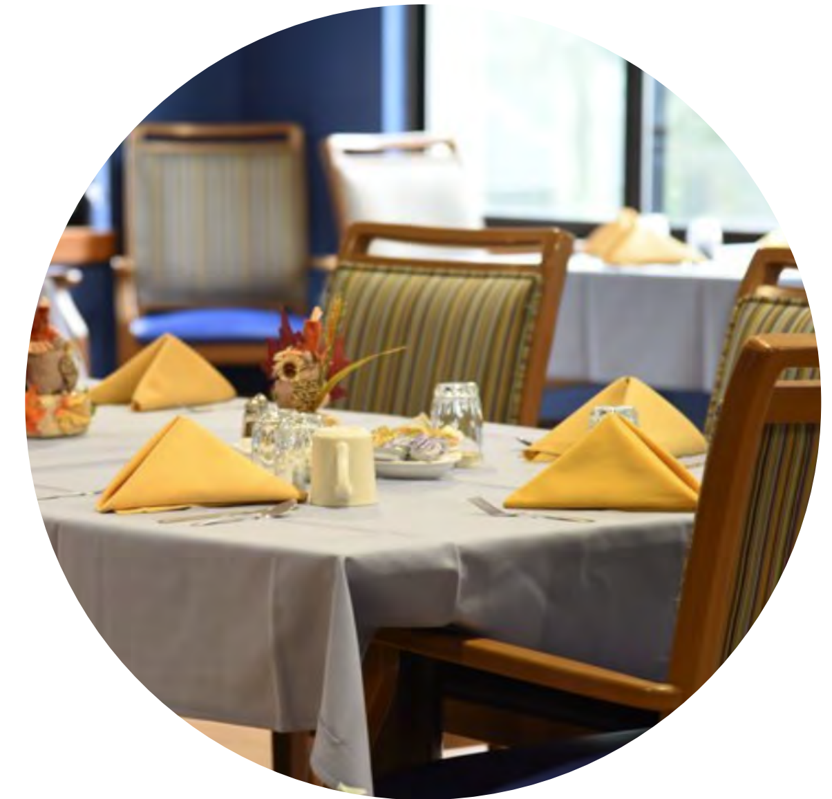
Nutritious & Tasty Meals