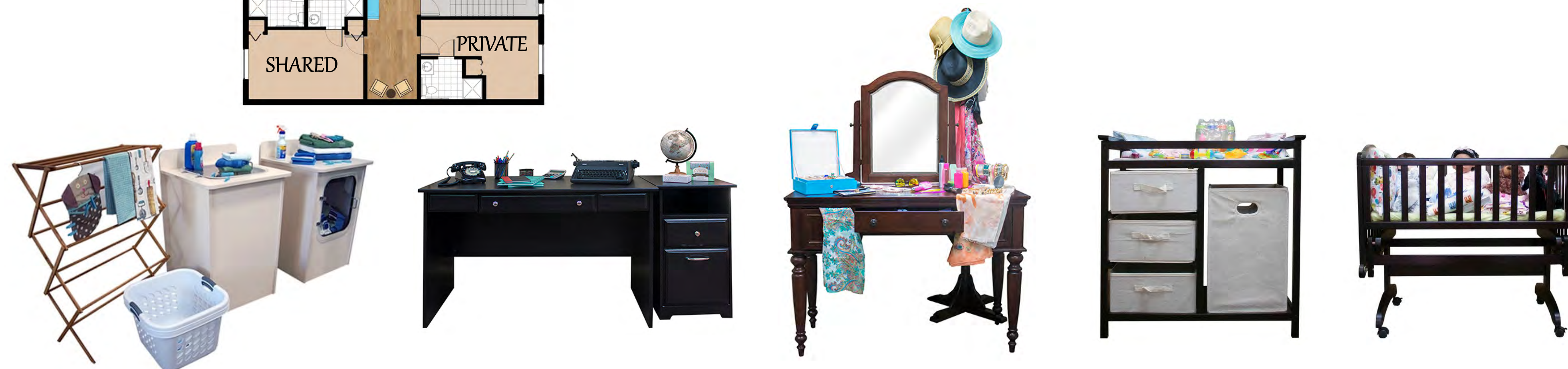
Memory Stations & Engaging Activities