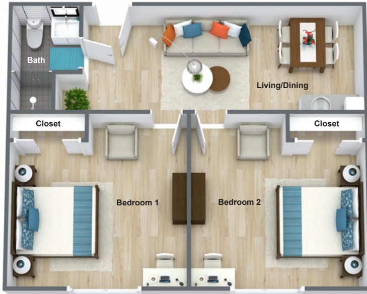
THE FAIRFAX Grand Suite