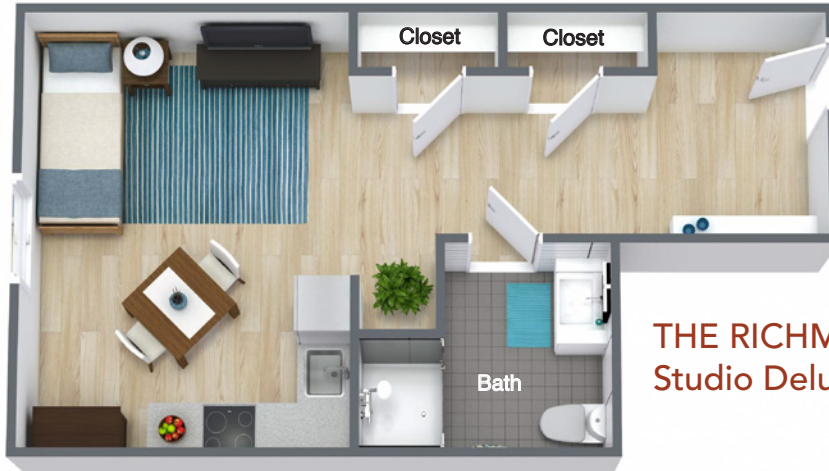
THE RICHMOND Studio Deluxe