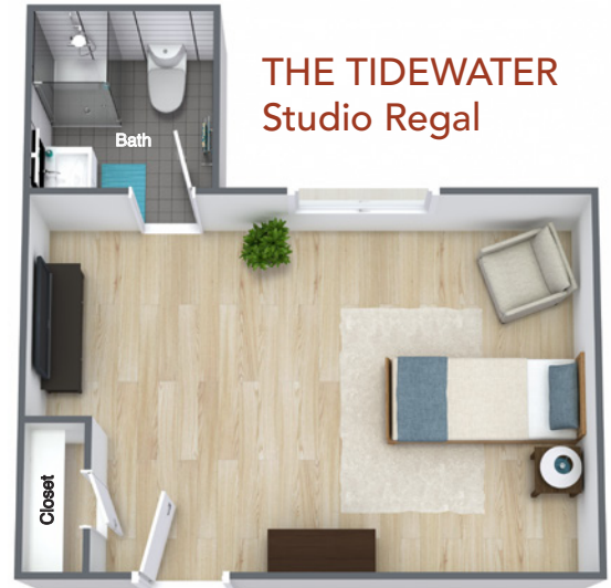
THE TIDEWATER Studio Regal