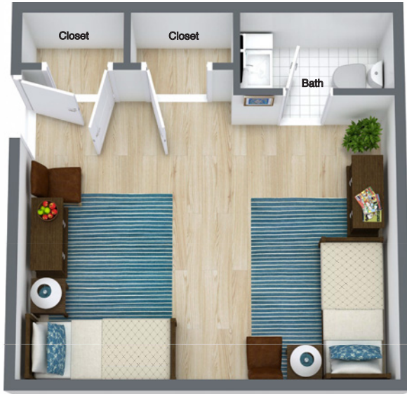
THE LANCASTER Companion Suite