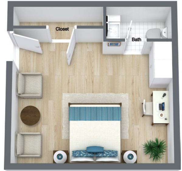
THE HAMPTON Private Suite