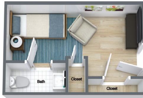
THE YORK Private Suite