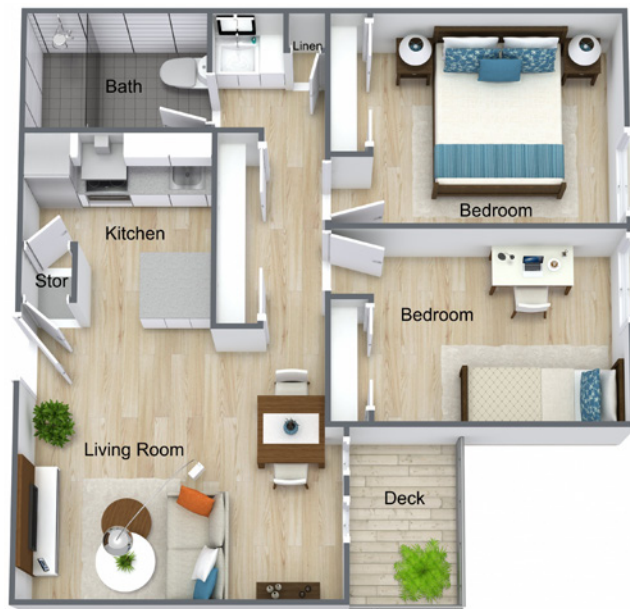
Cypress - Two Bedroom/One Bath