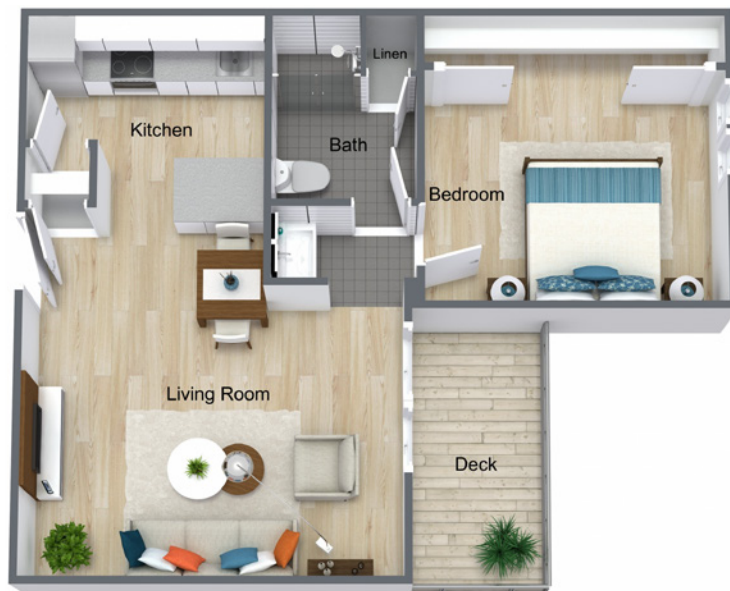
Dogwood - One Bedroom/One Bath