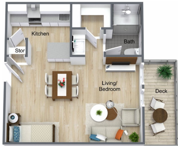
Magnolia - Studio