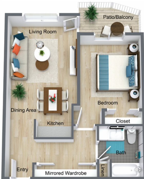
Camellia - One Bedroom