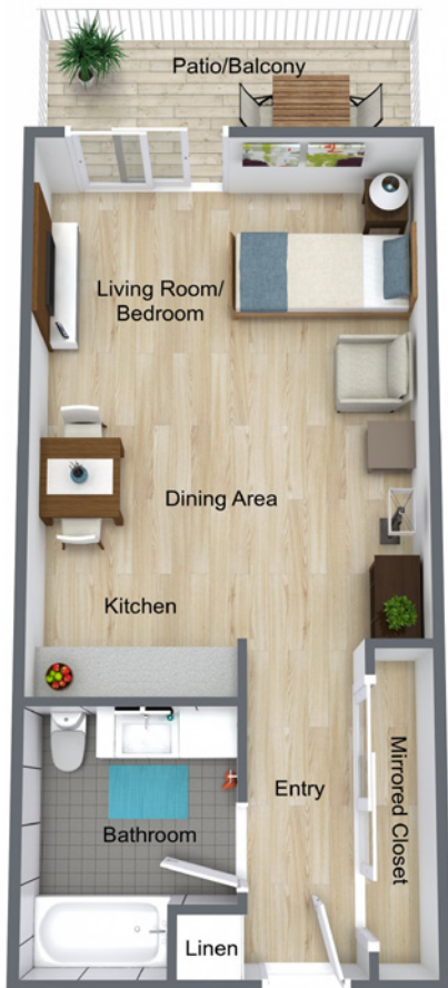
Primrose - Studio