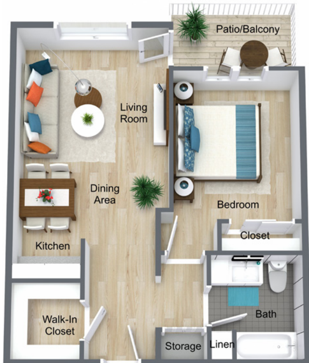
Lilac - One Bedroom/Walk-In Closet