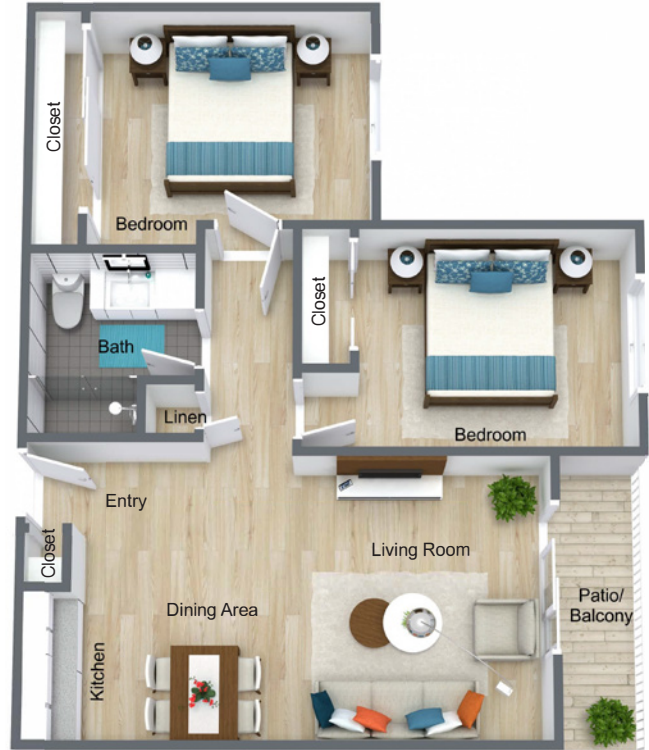
Magnolia - Two Bedroom