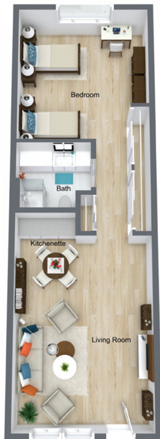
Orchard One Bedroom