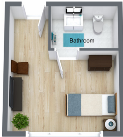
Avalon Large Studio