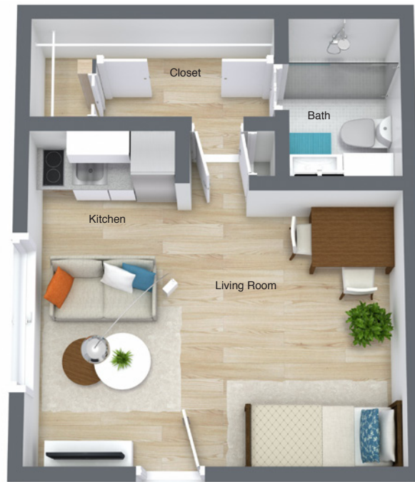
Dorman Studio Suite