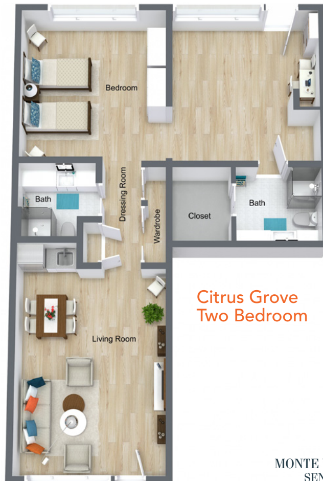
Citrus Grove Two Bedroom