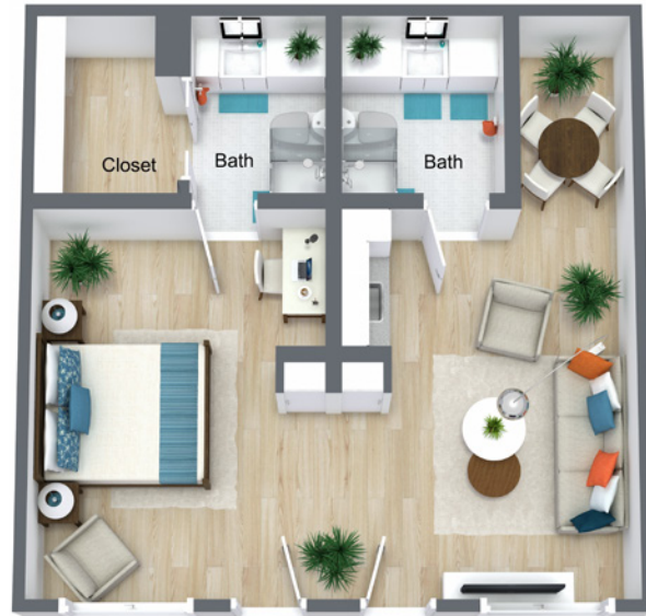
San Miguel One Bedroom