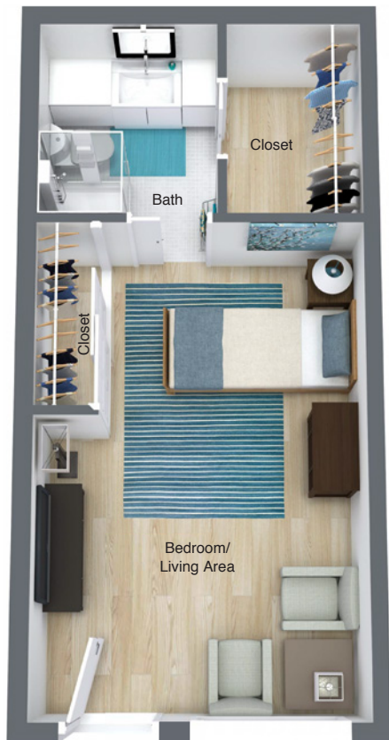
Allison Studio Suite