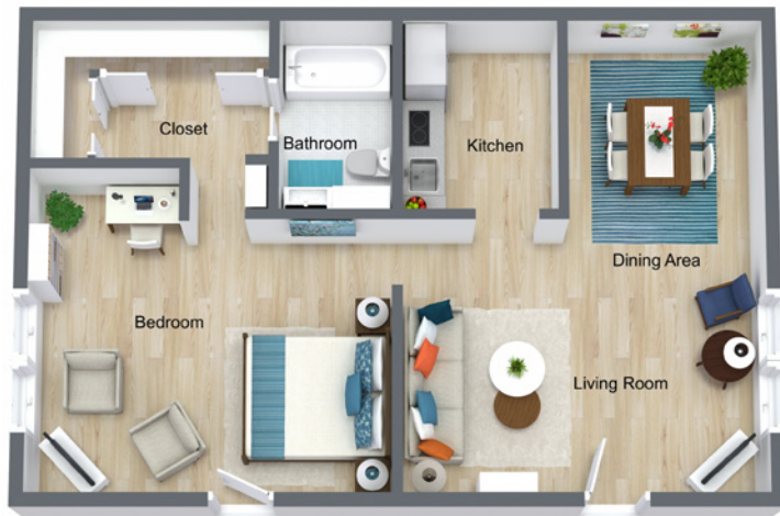
Broadway One Bedroom