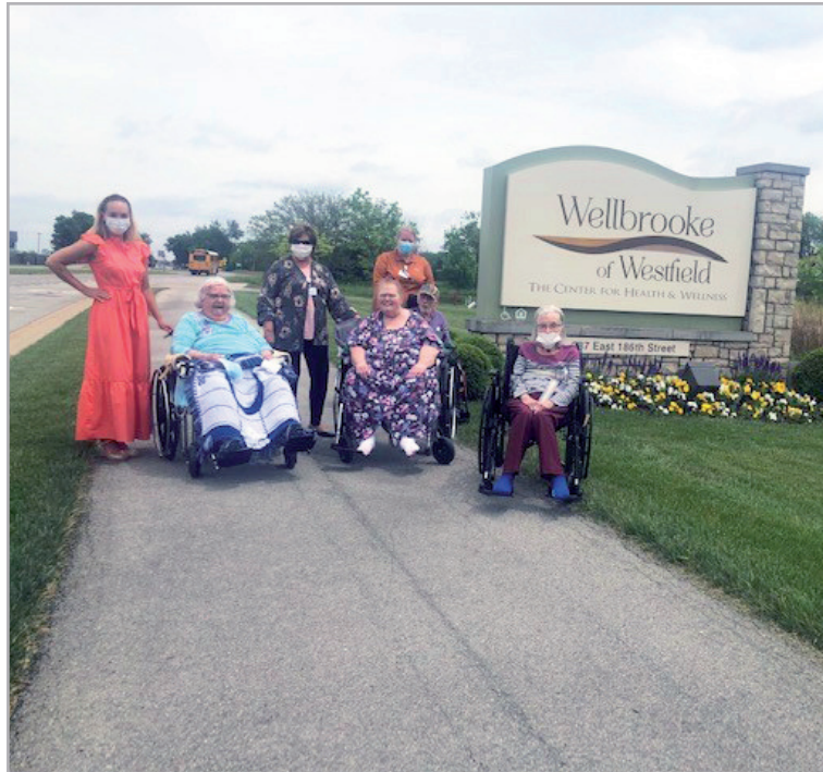
Residents and staff enjoy a walk around our pond to enjoy good sights and great company!

Wellness is important for both our residents and staff here at Wellbrooke of Westfield! Every morning at 10am we host a Sittercise class for residents and we love to bring it outside when the weather permits. Walks around our pond are also a favorite vitality exercise that staff and residents can enjoy with one another.