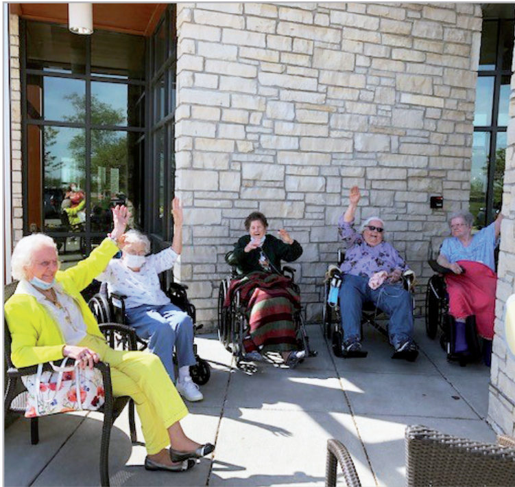
Residents enjoying the fresh air while getting in some exercise.