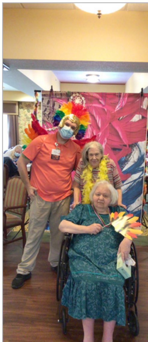
Everyone enjoying the photo booth!