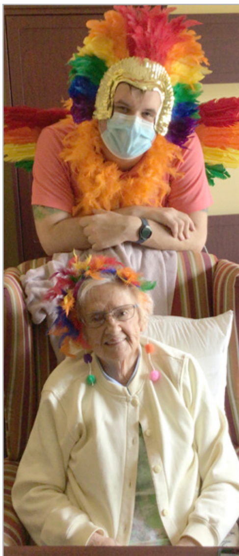
Smiles all around!