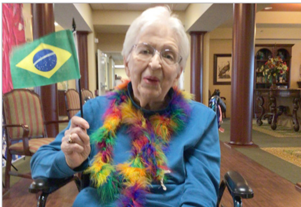
Celebration of South America!

In May, we celebrated the South American Carnival Theme Dinner. The bright colors and great food made for a very enjoyable Theme Dinner back in the dining room!