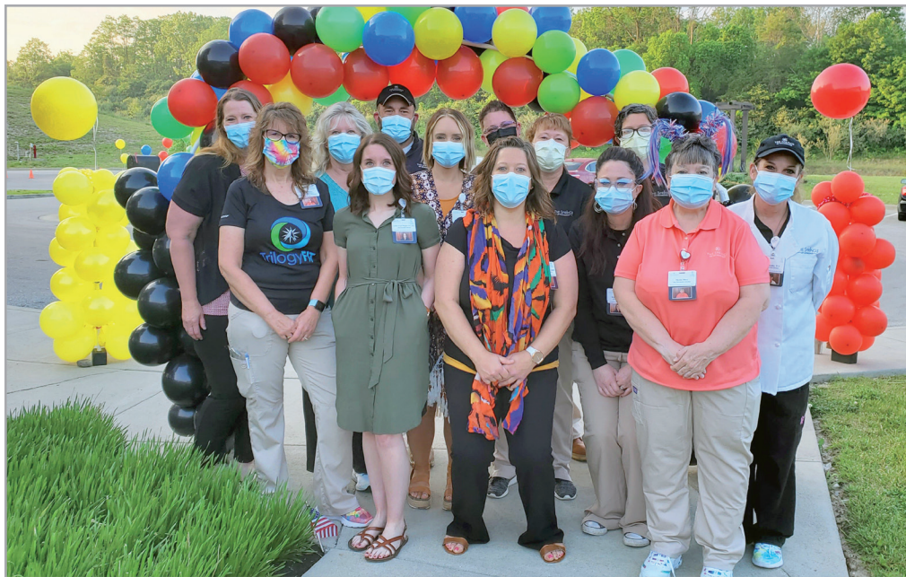
From The Springs of Richmond