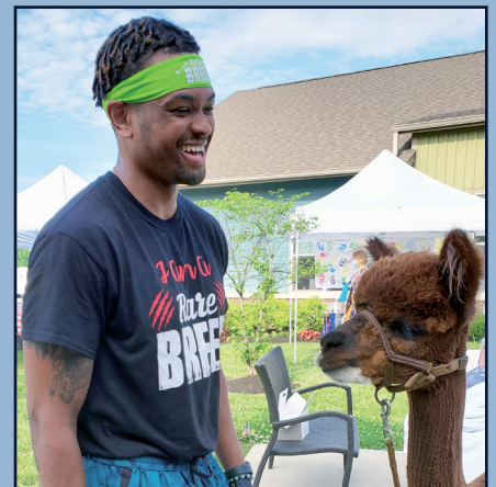
The instructor from Rare Breed