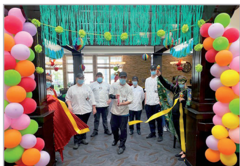
Dietary Team does the honors of cutting the ribbon for the long-awaited Grand Re-Opening of our Health Center Dining Room.