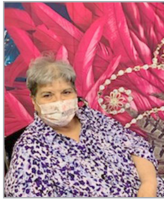
Pretty as a Picture