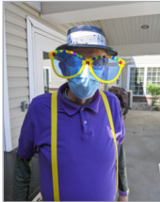
I can see clearly now!