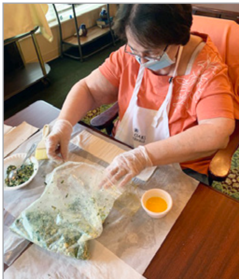
This Spinach Pie rocks!

WE ARE HAPPY TO ANNOUNCE THAT "HAPPY HOUR" is returning to Town Square! From 3:00 - 4:00pm each Friday, come on down to the Square, have a drink and a snack. Enjoy hanging out with friends, listening to music, and having a good time. We are slowly but surely working to get our entertainers back in the building. See you there!