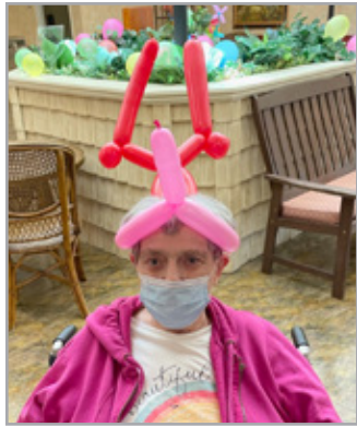
Do you like my hat?