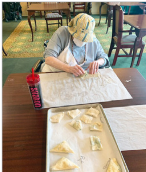
I think I've got it!