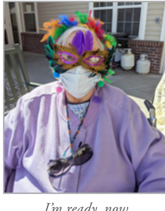
I'm ready, now where's the party?