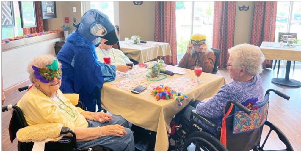
Ladies ready for dinner!