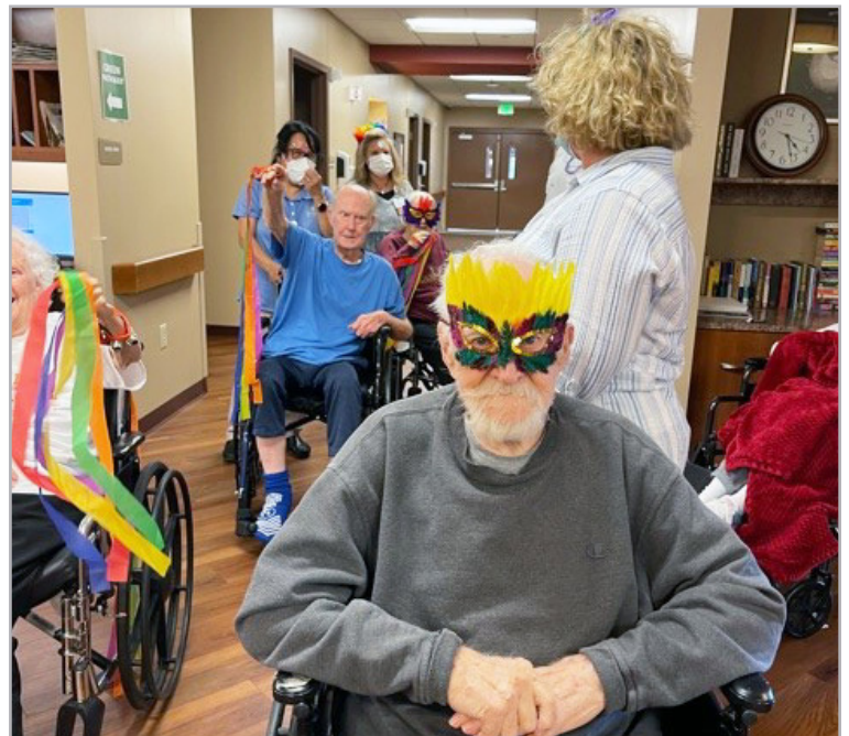
Red lined up for the parade