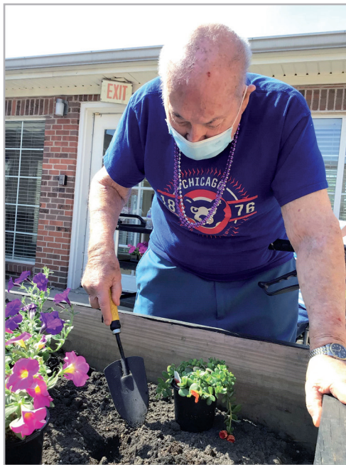
Mayford planting a purple flower in memory of his wife