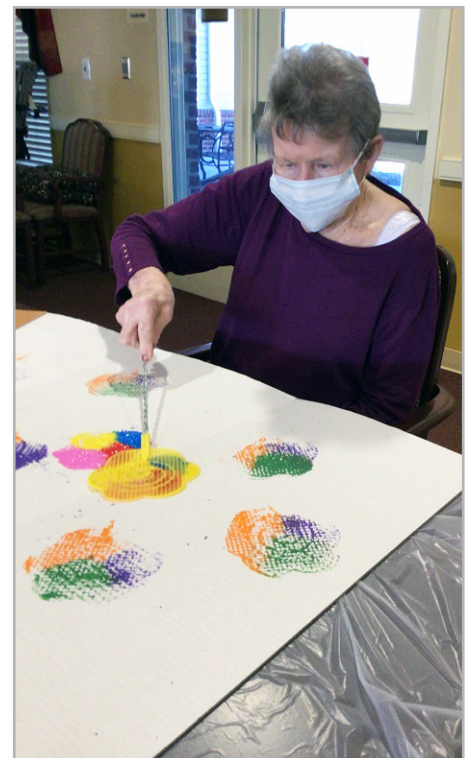
Creating masterpieces using bubble wrap.