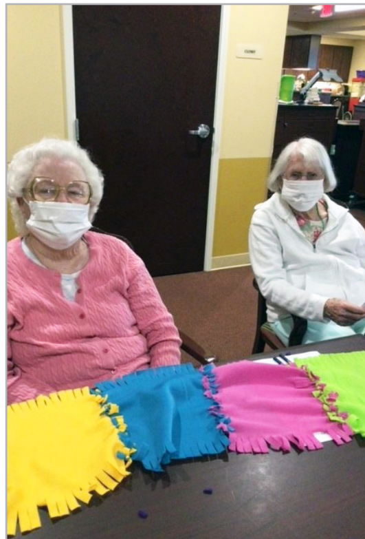
Enjoying quilting with good friends.