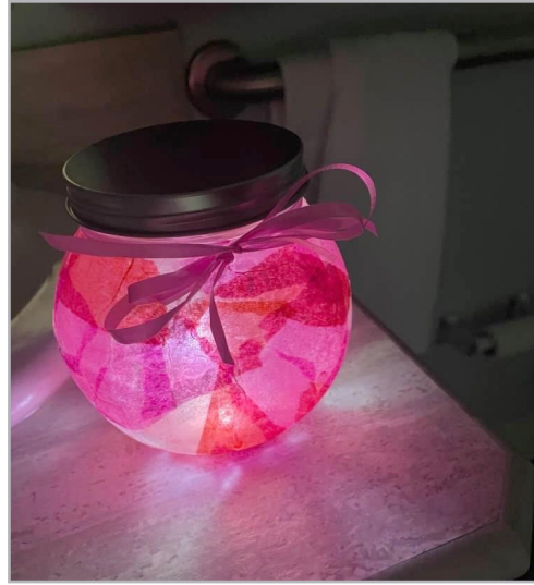
The finished jar lighting up the room!