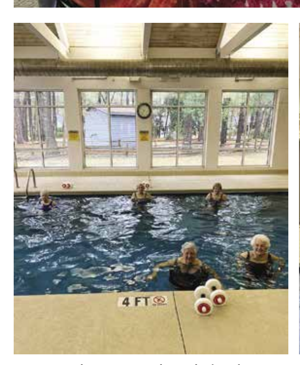
Residents were excited to get back in the pool for their first water aerobics class after getting vaccinated.