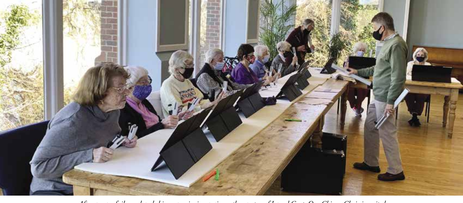
After a year of silence, hand chimes are ringing again on the campus of Laurel Crest. Our Chimes Choir is excited to have weekly practice again in anticipation of a performance in the coming weeks.