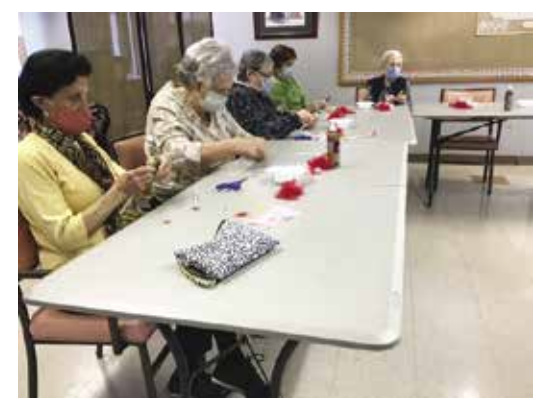
Residents make pencil toppers for the children who are a part of the backpack program at East End Elementary School in Easley, SC. The program benefits children who need food over the weekend.