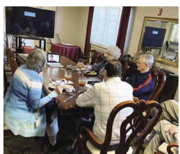
Residents enjoying lunch and a virtual training offered by the South Carolina Alzheimer's Association chapter.