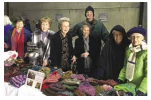
Laurel Crest residents at First Baptist event for the homeless (2019)