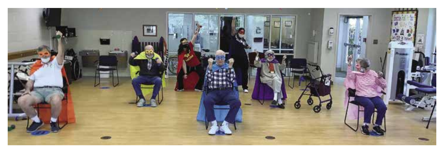
Above: Our wellness team trained residents to fight like superheroes for National Superhero Day.