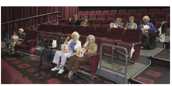
Our residents didn't let COVID stop them from going to the movies! Laurel Crest rented a sanitized theatre just for our residents. They enjoyed the opportunity to go to a private showing with some great movie theatre popcorn and candy!