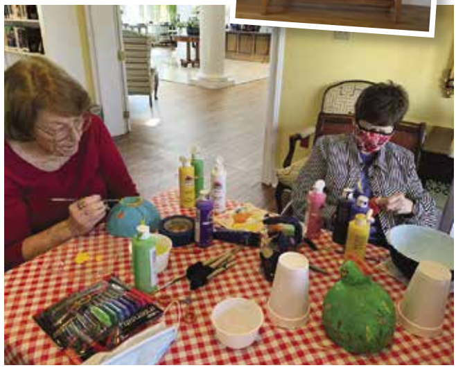
Crafting is a great opportunity for some of our residents to express their creativity and also gain the sense of accomplishment by creating something useful.