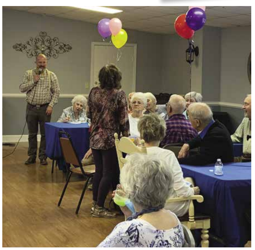
Independent Living residents were thrilled to be able to meet and mingle again.