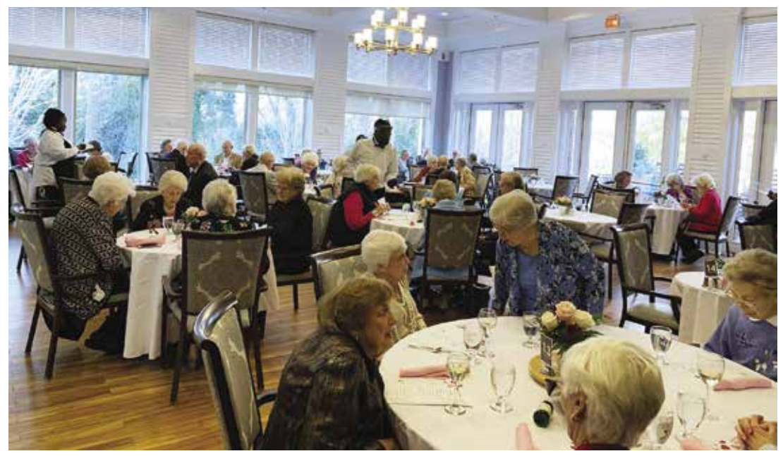
Each year, normally the week of Valentine's Day, we have a friendship dinner to celebrate our friendships and to cultivate new friendships. This year, due to COVID restrictions, we had to delay our dinner; however, our residents were thrilled when the time came to celebrate together.