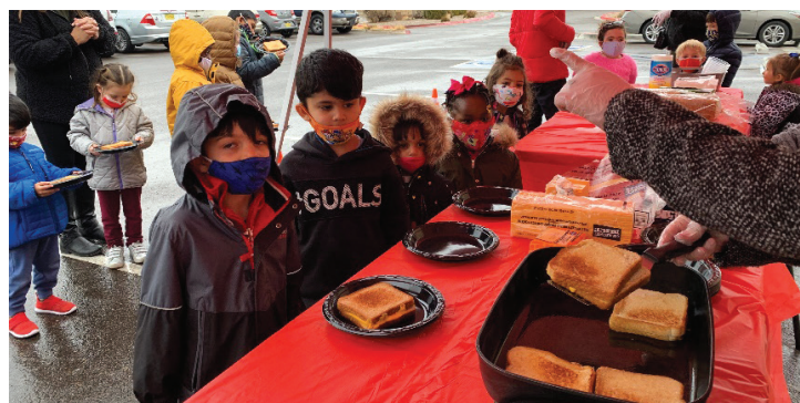
Children of Montessori One love grilled cheese sandwiches!