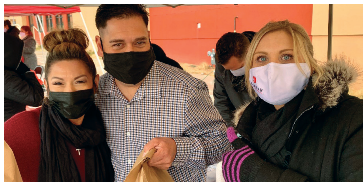
Thank you to our community partners for their support.