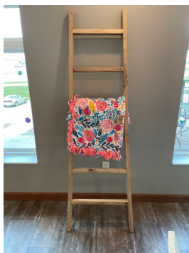
This beautiful blanket ladder was made and donated to us! Perfect for the blankets we make!