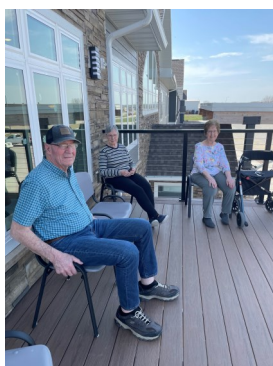
Enjoying some time on the deck!