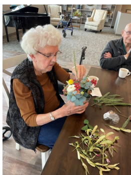
Putting together our own flower arrangements!