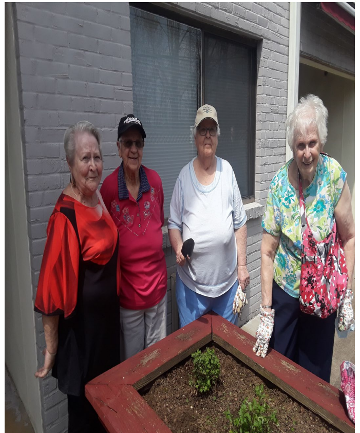
Meet our Garden Club