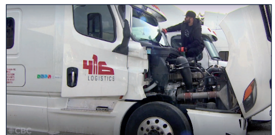
Original story from Good News Network