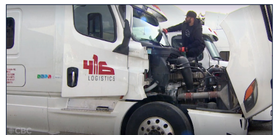
Original story from Good News Network