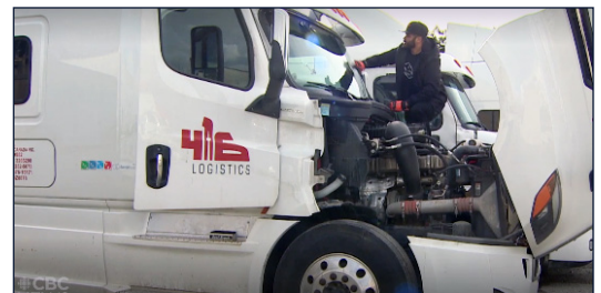
Original story from Good News Network