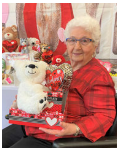
Valentine's Day Fun