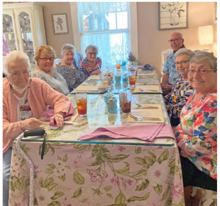
Amazing meal and atmosphere at the Lavender 'n Lace