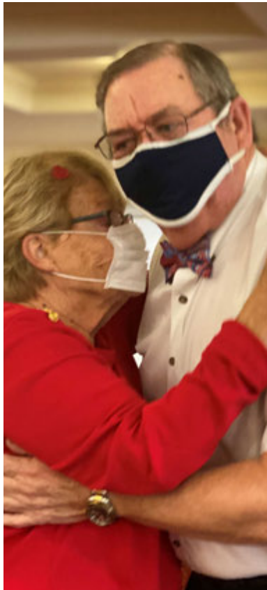
Little dancing on Valentine's Day