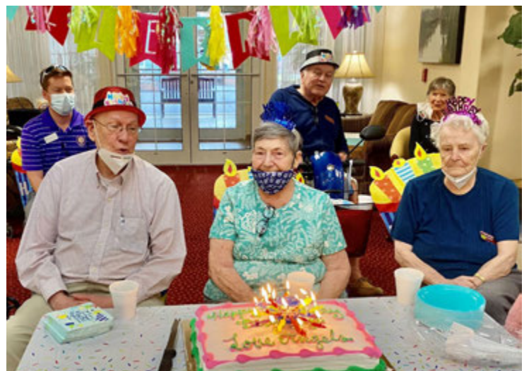
Celebrating our February Babies!