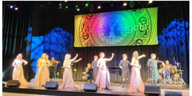
The Celtic Angels was a great show right next door; let's do more of these!