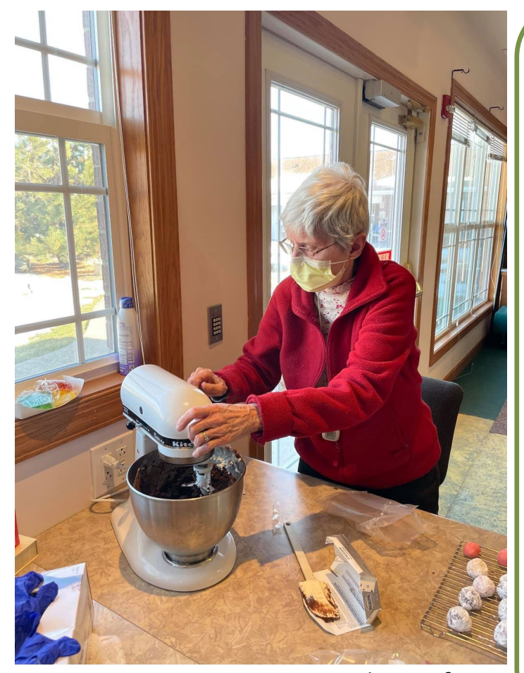
Learning new recipes are always fun and bring lots of smiles.