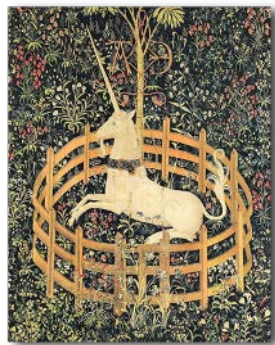
The Greek historian Ctesias described unicorns as having white bodies, dark red heads, blue eyes, and multicolored horns.

In 1508, Ponce de León colonized Puerto Rico and became its governor, but a political rift forced him to give up Puerto Rico to Diego Columbus, the son of Christopher Columbus. After De León’s death, Gonzalo Fernandez de Oviedo, a Spanish court historian and ally of Diego Columbus, wrote a misleading account of a bumbling and foolish De León searching for a magical fountain of youth in Florida. While many at the time knew the writings to be a satirical smear campaign against De León, over the centuries Oviedo’s fantastical fictions have morphed into fact, facts happily accepted by all those who want to believe in the magical Fountain of Youth.