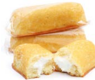
Twinkies were originally filled by workers pedaling a mechanical filler with their feet.