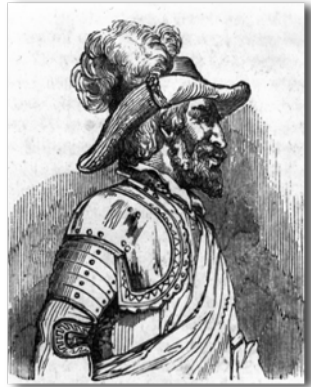
De León is credited for discovering the Gulf Stream, which sped voyages from Spain to North America.

On April 2, 1513, explorer Juan Ponce de León landed on a peninsula he called “La Florida” and claimed it for the Spanish crown. But why had he come? Some say he was searching for the Fountain of Youth, a spring that granted eternal youth to whoever bathed in its waters.