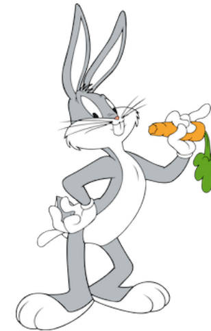
Bugs Bunny's original voice was later used to voice Woody Woodpecker.

On April 30, 1938, Warner Bros. released a new Looney Tunes cartoon featuring Porky Pig as a hapless hunter trying to unsuccessfully bag a humorously hyperactive rabbit named Happy. How could audiences know that this rabbit would evolve into Bugs Bunny, one of the most recognizable cartoon characters of all time?