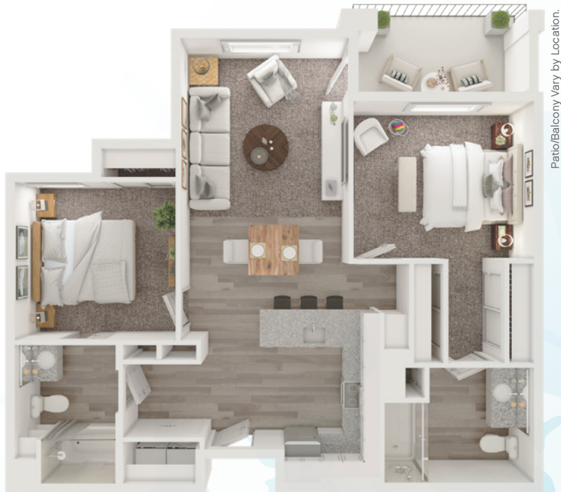
PLAN B1 1,019 Sq. Ft. 2 Bedroom / 2 Bath