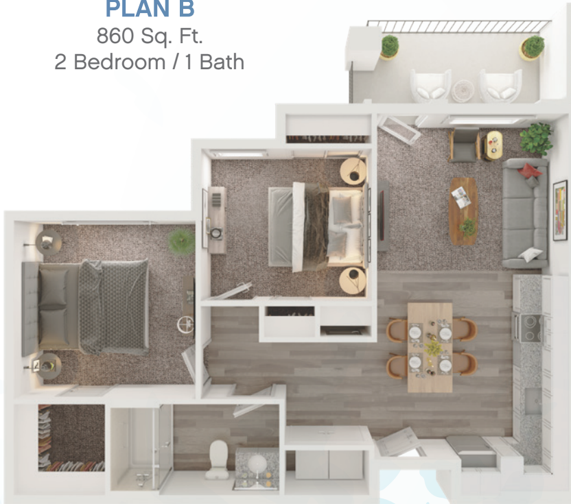
PLAN B 860 Sq. Ft. 2 Bedroom / 1 Bath