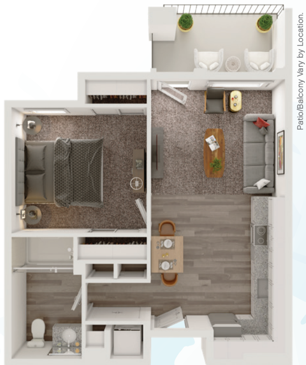
PLAN A 617 Sq. Ft. 1 Bedroom / 1 Bath