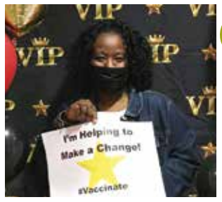
The Columbia Community celebrates its vaccine VIPs.