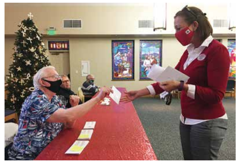
Employee appreciation check distribution.