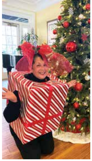
Santa's helpers created a festive mood at Laurel Crest, dressing up and deliverying stockings to residents.