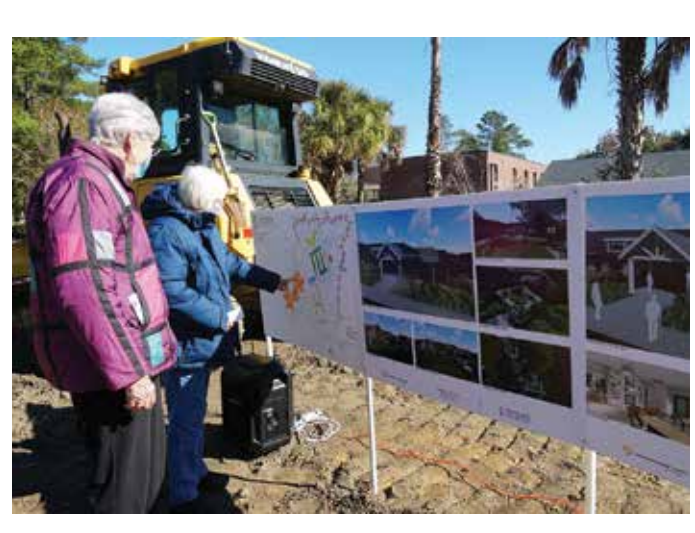
Above: Attendees at the groundbreaking ceremony explore renderings of the new facility, scheduled for completion in late 2021.

Right, top to bottom: Renderings of the memory support center's exterior, dining room, common area and rear courtyard.