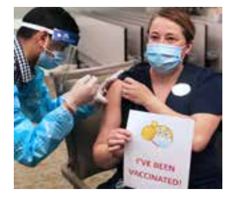
Looking good for the Summerville Facebook page.

s I write this, we near the end of the first year of the COVID-19 pandemic, a year unlike any we have ever seen. No aspect of our society has been untouched by this crisis. But has any segment been more deeply impacted than senior living? The past year brought unimagined change to our ministry. Much of this change was difficult and painful. Residents were kept safe for the most part, but at the cost of so much social contact with friends and family. How many times did we say, in one way or another, "Turn, O Lord! How long? Have compassion on your servants!" (Psalm 90:13).