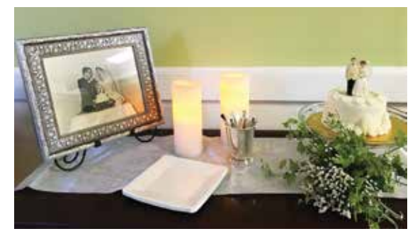
Momentos from 60 years ago.

as well as cake complete with the original wedding bride and groom topper.