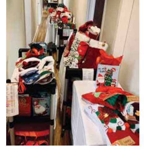
Stockings line the hallway in preparation for delivery to residents.

excited to receive their stockings! It was a heartwarming and uplifting experience for us all.